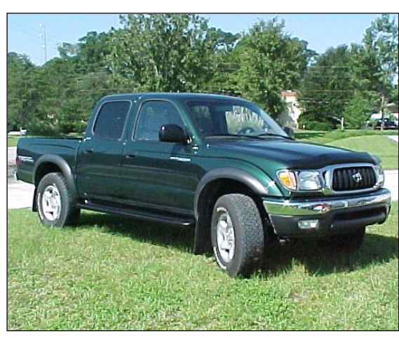
That's SHARP !!!