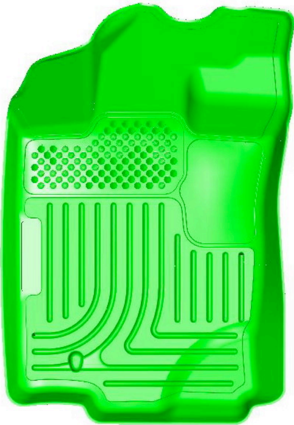
LEFT OR DRIVER'S