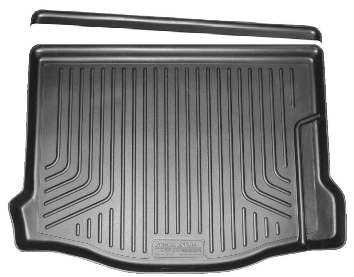
LINER SHOWN TRIMMED FOR USE WITH FULL SIZE SPARE TIRE