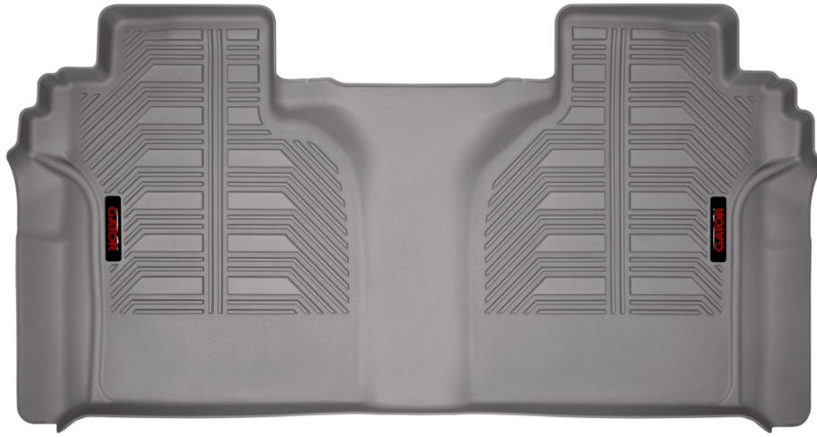
SECOND SEAT LINER

TO EASE INSTALLATION OF YOUR TRUCKS SECOND SEAT LINER, MOVE BOTH FRONT ROW SEATS TO THEIR MOST FORWARD POSITION. WITH THIS DONE, INSTALL YOUR LINER, POSITIONING IT AS SHOWN IN THE IMAGE ABOVE. ONCE THE LINER IS INSTALLED, REPOSITION THE FRONT SEATS AS DESIRED.