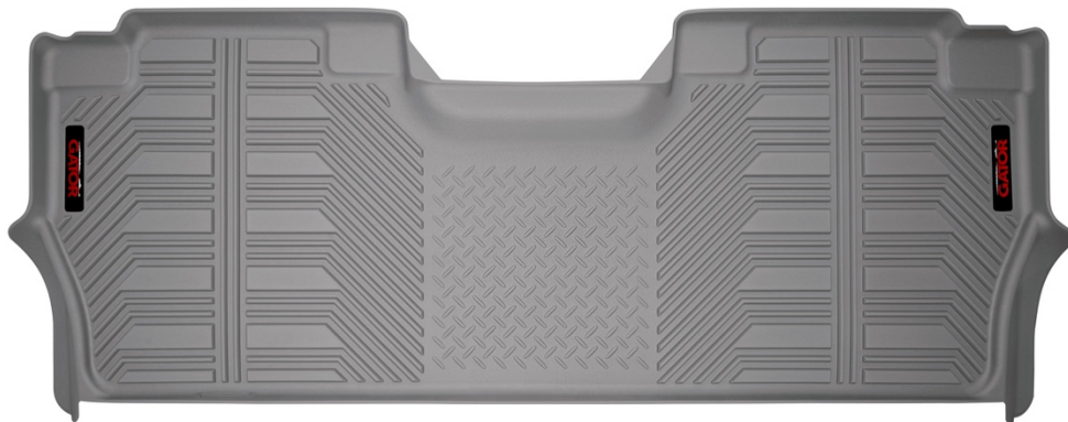
SECOND SEAT LINER

TO EASE INSTALLATION OF YOUR TRUCKS SECOND SEAT LINER, MOVE BOTH FRONT ROW SEATS TO THEIR MOST FORWARD POSITION. WITH THIS DONE, INSTALL YOUR LINER, POSITIONING IT AS SHOWN IN THE IMAGE ABOVE. ONCE THE LINER IS INSTALLED, REPOSITION THE FRONT SEATS AS DESIRED.