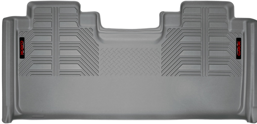
SECOND SEAT LINER

TO EASE INSTALLATION OF YOUR SECOND SEAT LINER, MOVE BOTH FRONT ROW SEATS TO THEIR MOST FORWARD POSITION. WITH THIS DONE, INSTALL YOUR LINER, POSITIONING IT AS SHOWN IN THE IMAGE ABOVE. ONCE THE LINER IS INSTALLED, REPOSITION THE FRONT SEATS AS DESIRED.