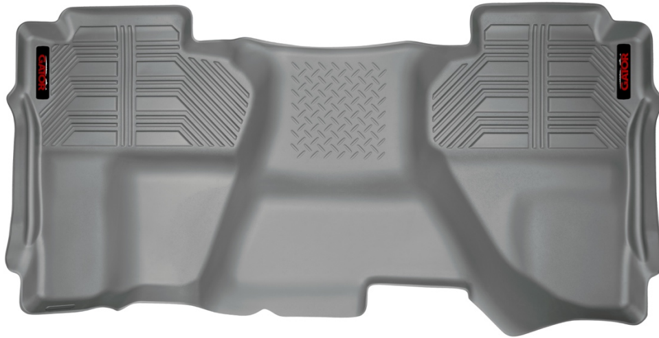
SECOND SEAT LINER

TO EASE INSTALLATION OF YOUR SECOND SEAT LINER, MOVE BOTH FRONT ROW SEATS TO THEIR MOST FORWARD POSITION. WITH THIS DONE, INSTALL YOUR LINER, POSITIONING IT AS SHOWN IN THE IMAGE ABOVE. ONCE THE LINER IS INSTALLED, REPOSITION THE FRONT SEATS AS DESIRED.