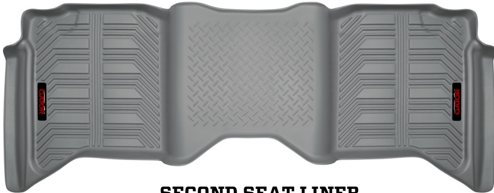
SECOND SEAT LINER

TO EASE INSTALLATION OF YOUR SECOND SEAT LINER, MOVE BOTH FRONT ROW SEATS TO THEIR MOST FORWARD POSITION. WITH THIS DONE, INSTALL YOUR LINER, POSITIONING IT AS SHOWN IN THE IMAGE ABOVE. ONCE THE LINER IS INSTALLED, REPOSITION THE FRONT SEATS AS DESIRED.