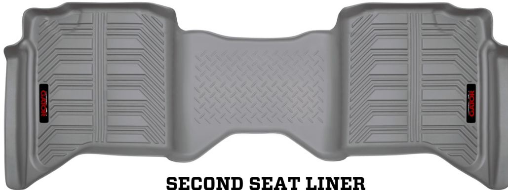
SECOND SEAT LINER

TO EASE INSTALLATION OF YOUR TRUCKS SECOND SEAT LINER, MOVE BOTH FRONT ROW SEATS TO THEIR MOST FORWARD POSITION. WITH THIS DONE, INSTALL YOUR LINER, POSITIONING IT AS SHOWN IN THE IMAGE ABOVE. ONCE THE LINER IS INSTALLED, REPOSITION THE FRONT SEATS AS DESIRED.