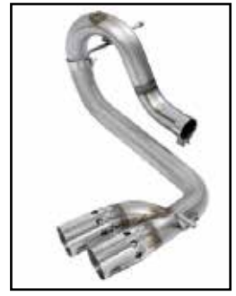
P/N: 49-44065-B (Blk Tip) 49-44065-P (Pol Tip)