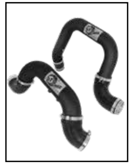
P/N: 46-20264-B (Blk) 46-20264-R (Red)