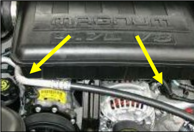
4. Loosen and remove the two 10mm bolts holding on the factory throttle body air chamber intake assembly.