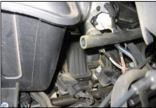
5. 2002 & 2003 Models Only: Disconnect the crankcase vent hose on the back of the factory throttle body air chamber.