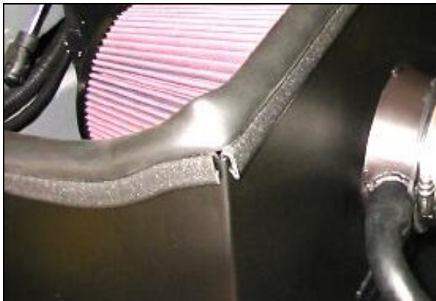
18. 2004-05 Models Only: Connect the factory breather hose to the Airaid Cool Air Dam & secure using the #24 Speed clamp provided.