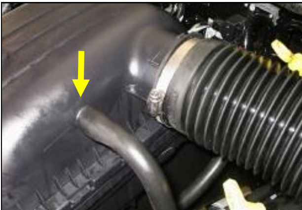
2. 2004-05 Models Only: Disconnect the factory breather hose from the factory air box lid.