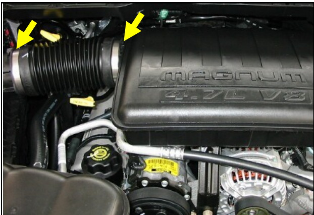
1. Disconnect The Negative Battery Terminal! Loosen the two hose clamps on the factory air tube.

Full color instructions can be viewed on our web site at Airaid.com . Use the Product Search function to find your part number, and click View Details .