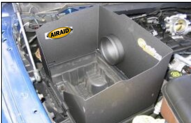
10. Position the Airaid Cool Air Dam in place of the original air box lid. Snap in place.