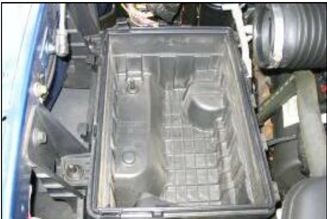
3. Unsnap and remove the factory air box lid, tube, & factory air filter.