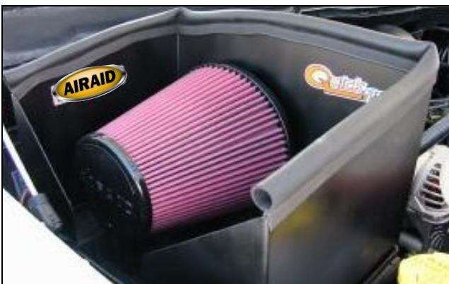
11. Mount the Airaid Premium filter inside the Cool Air Dam & secure with hose clamp provided. In addition, install the weather strip hood seal on the Cool Air Dam. (Hint: begin in a corner and work it on toward the ends)