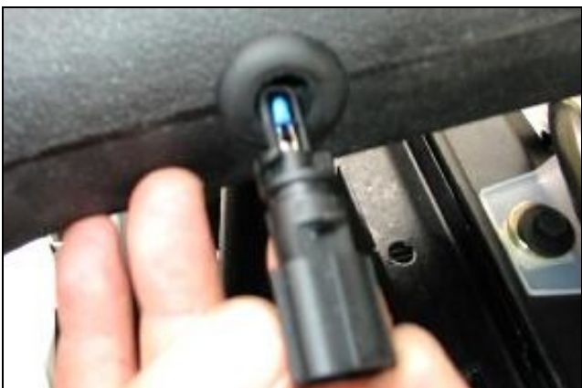
9. 2003-2005 Models Only: Install rubber grommet w/thru hole and insert the factory air temperature sensor into the grommet.