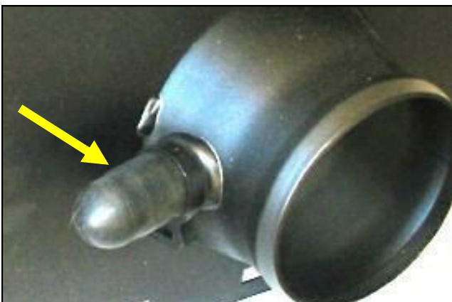
17. 2002 & 2003 Models Only: Slip the black rubber cap over the nipple on the Cool Air Dam and secure using the #19 Speed clamp provided.