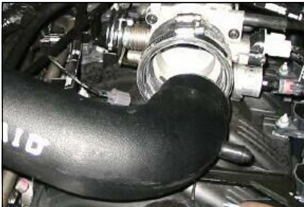
13. Position Airaid tube into place by connecting hump hose to Airaid Cool Air Dam and connect the other end of the tube to the factory throttle body coupler. Utilize the #60 hose clamps on the hump hose and #56 hose clamp on the factory coupler.