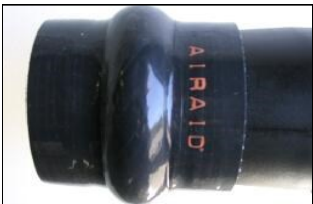
12. Install urethane hump hose onto the Airaid tube and secure using a # 60 hose clamp provided.