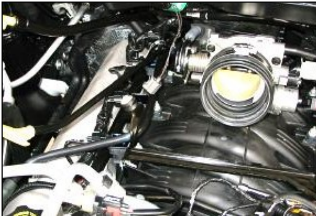
7. Unsnap the factory intake assembly from front of bracket and remove assembly from vehicle. (Note: leave the factory coupler on the throttle body)