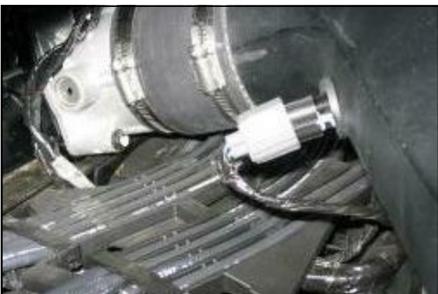
14. Re-connect air temperature sensor connector to the sensor in the Airaid tube.