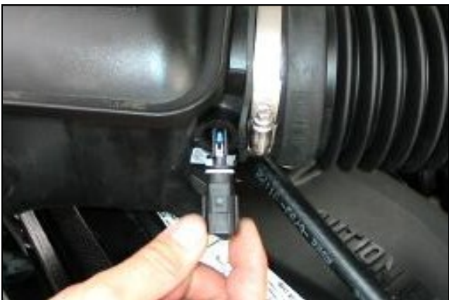
6. 2003-05 Models Only: Disconnect air temperature sensor wire on back of factory throttle body air chamber and remove sensor. Retain sensor for later use with the Airaid Intake System.