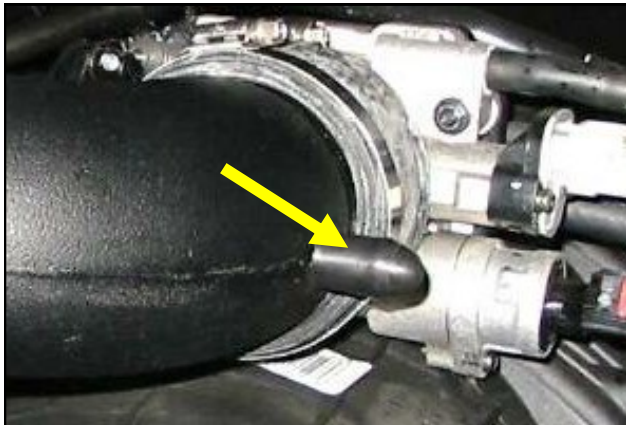
16. 2004-05 Models Only: Slide the provided rubber cap over the nipple at the throttle body end of the Airaid tube.