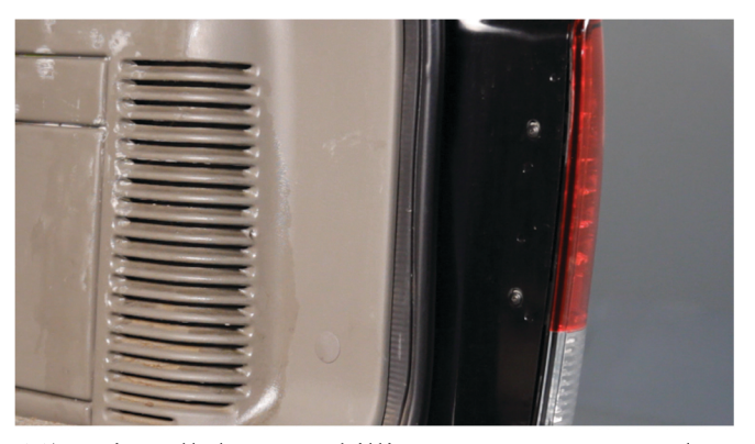
11) Reinstall the two phillips screws to secure the tail light.