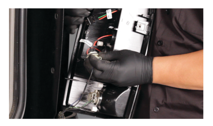
8) Connect the turn signal socket to the center socket insert of the Spyder tail light. Align the black wire side of the socket with the black wire side of the insert to ensure correct polarity. Reinstall the socket.