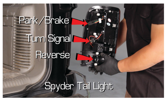
7) Install the reverse lamp socket into the Spyder tail light.