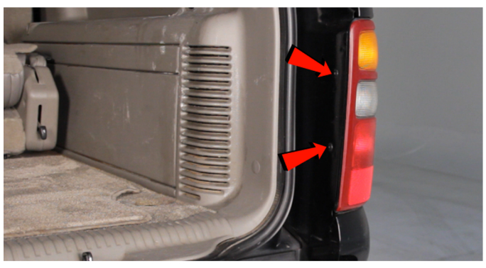
2) Remove [2x] Phillips Bolts securing the tail light.