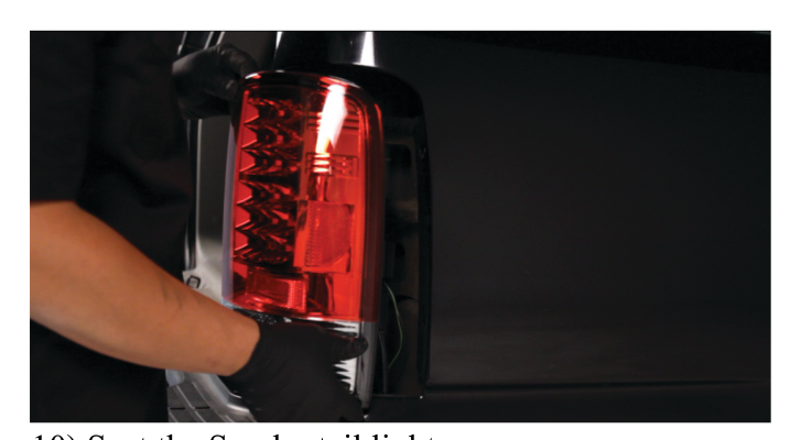
10) Seat the Spyder tail light.