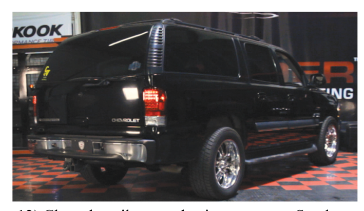
12) Close the tailgate and enjoy your new Spyder LED tail lights.