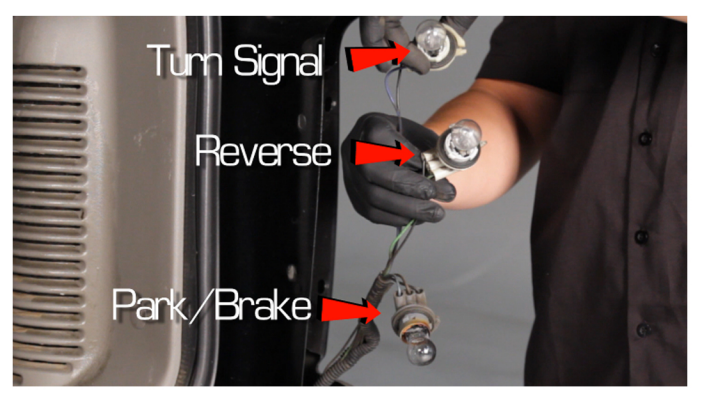
4) Remove the turn signal, reverse lamp and brake lamp bulb sockets from the OEM tail light. Never touch exposed bulbs with bare hands.