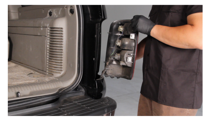
3) Unseat the tail light.