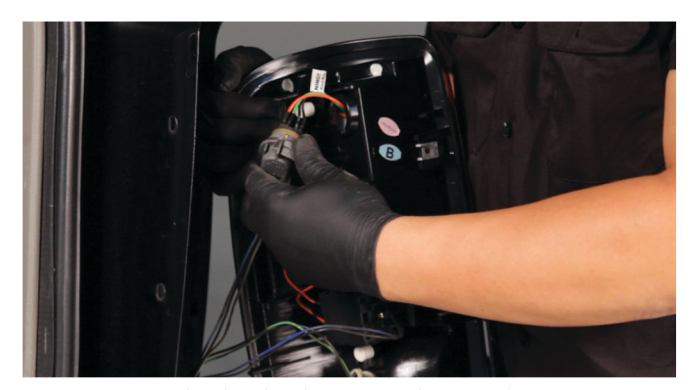
9) Connect the brake lamp socket to the upper socket insert of the Spyder tail light. Align the black wire side of the socket with the black wire side of the insert to ensure correct polarity. Reinstall the socket. Your Spyder LED tail light is now ready to install.