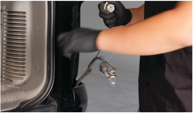
5) Remove the turn signal bulb from its socket. Never touch exposed bulbs with bare hands.