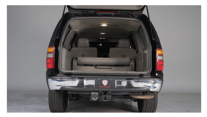
1) Open the tailgate.