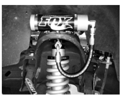
Fig. 3: Driver side

9. Connect the shock assembly to the lower control arm using the (2) bolts