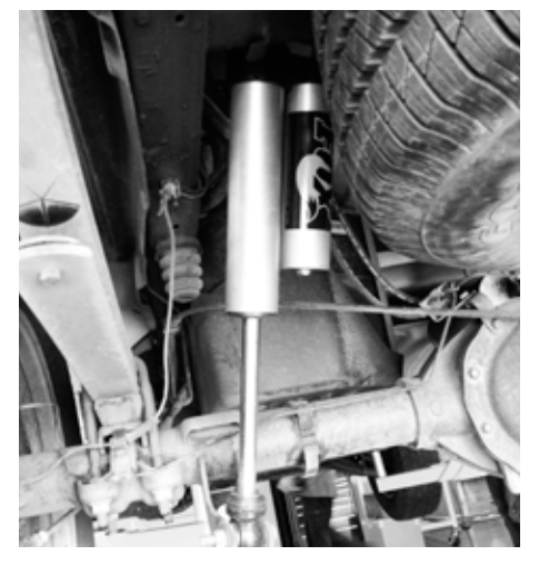
Fig. 3: Driver side