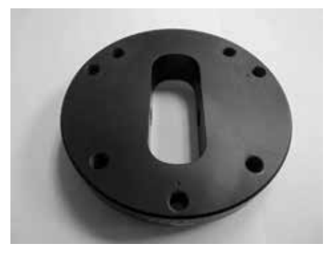
Fig. 2: Correct holes marked with a dot