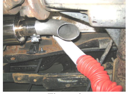
3. Loosely install the Turn Down connecting it to the Muffler outlet with the 2 ½" Hanger Clamp . Install the Hanger Assembly to the 2 ½" Hanger Clamp and to an existing hole in the frame using the fasteners provided. Refer to Figures 6 &7 .

4. Ensure that the exhaust is properly in place before tightening clamps. Start at the front of the exhaust system and begin tightening all connections.