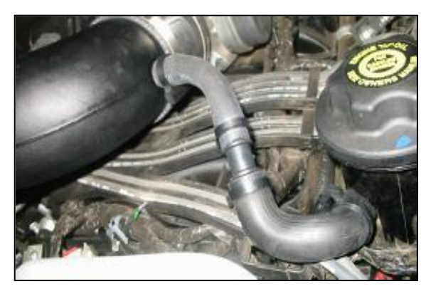
13. 2003 Models: Reconnect the factory breather hose using the 1/2" x 5/8" connector (#21) and 1/2" x 4 1/2" breather hose. Secure the ends with the #16 speed clamps (#17), and the #22 speed clamps (#18) as shown.