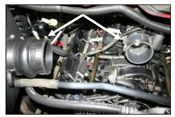
10. Install the supplied reducing coupler (#4), onto the throttle body using one #52 hose clamp (#10) on the throttlebody and one #56 hose clamp (#11) on the open end. Install the hump hose (#5) with two #60 hose clamps (#12) onto the CAD .