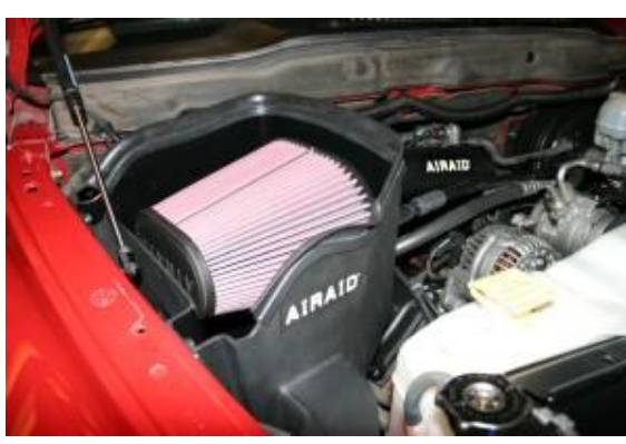
14. Install the Airaid Premium Filter (#1) onto the tube on the filter adapter and tighten the clamp. Next install the weather strip (#7) on the top of the Quick Fit Panel as shown. (Hint: Start at one end of the CAD and work your way towards the other end)