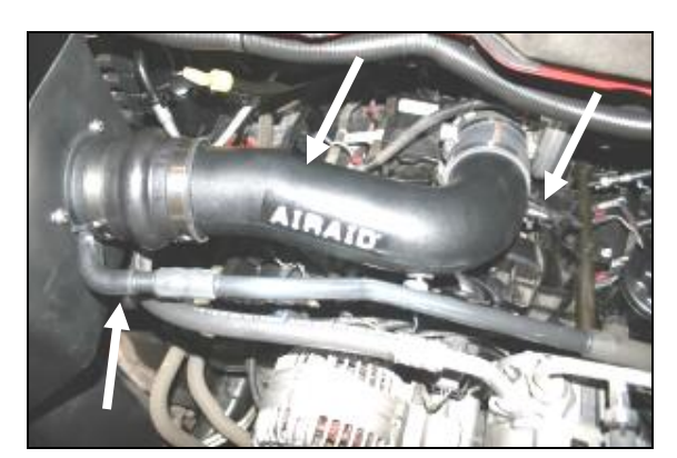
12. Install the Airaid intake tube into the hump hose first, and then into the reducing coupler. Adjust for fit, and then tighten all four hose clamps. 2004-08 Models: Reconnect the breather by sliding the 3/4" x 2" hose (#24) over the factory breather tube. Next insert the 1/2" to 3/4" barbed connector (#20) into the 3/4" hose. Now connect the 1/2" rubber elbow (#15) between the 1/2" barbed fitting on the CAD and the previous fitting. Now slide the rubber cap (#14) over the nipple on the Airaid intake tube and secure it with the #14 speed clamp (#16).