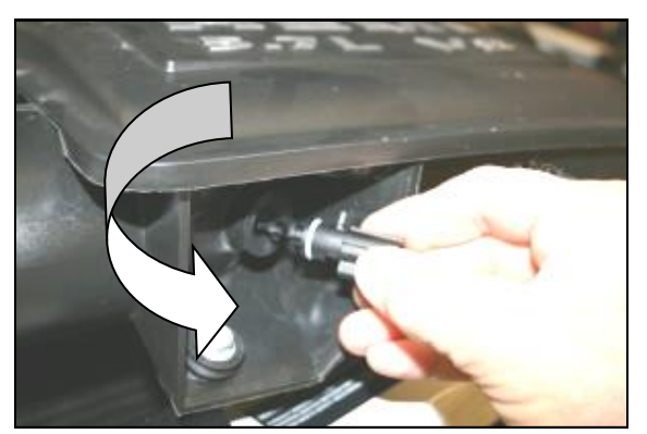
5. Gently twist the air temperature sensor counterclockwise and remove it from the resonator. The sensor will be reinstalled in step #11.