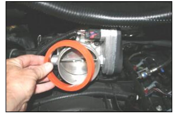
3. Remove the factory seal from the throttle body.