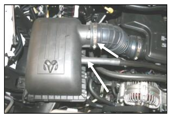
1. Disconnect the negative battery cable! Loosen the hose clamp on the flexible intake tube at the airbox lid. Disconnect the breather hose going into the factory airbox lid. Slide the flexible tube off of the lid and lift the airbox assembly straight up and out of the vehicle. 2003 Models: Disconnect the breather hose from the back of the resonator.