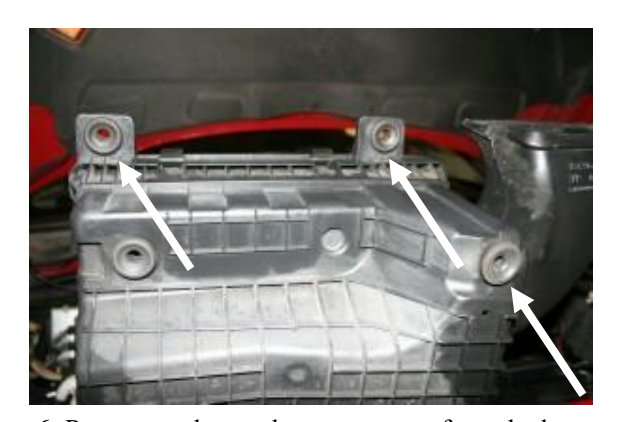
6. Remove and save three grommets from the bottom of the factory airbox. They will be reused in step #7.