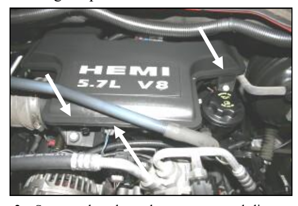
2. Squeeze the tab on the connector and disconnect the intake temperature sensor wiring harness on the front of the resonator. Next remove the two bolts that secure the resonator to the engine. Lift the resonator up at the front, and remove it from the vehicle.