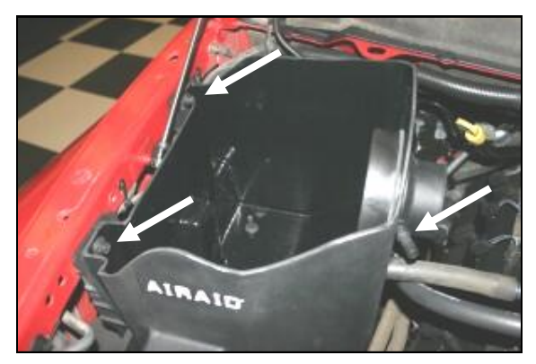
9. Install the CAD into the vehicle by aligning the grommets over the locating pins on the factory airbox mount. Reinstall the factory bolts in the fender that were removed in step #4. Next install the 1/4"NPT x 1/2" barbed fitting (#19) into the

2003 Models: Install the 1/4"NPT plug (#22) in place of the barbed fitting.