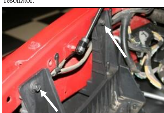
4. Using a 13mm socket, remove two bolts holding the airbox mounting bracket to the inner fender. These bolts will be reused in step #9.