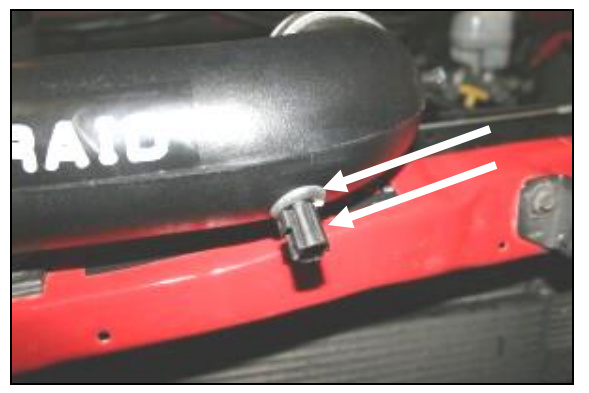
11. Install the supplied grommet (#13) into the Airaid intake tube(#2). Next, carefully install the factory air intake temperature sensor into the grommet in the tube. Make sure it is fully seated into the grommet.