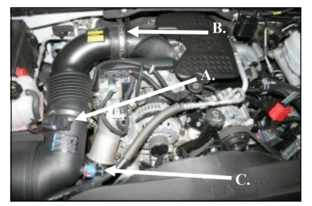
1. Disconnect the negative battery cables.

Full color instructions can be viewed on our web site at Airaid.com. Use the Product Search function to find your part number, and click View Details .