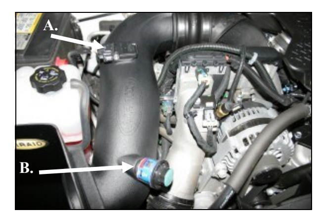
7. A.) Reinstall the Mass Air Flow sensor into the Airaid Intake Tube using two 8-32x 3/8" button head screws (#8). Do Not Use The Factory Screws! B.) Next, reinstall the factory filter minder and grommet into the Airaid Intake Tube.