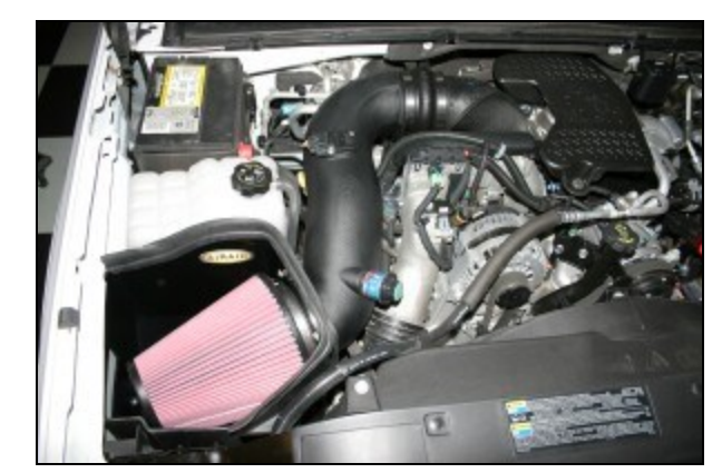
9. Congratulations on the successful install of your new Airaid Intake System!