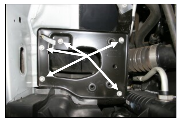
3. Using a 10mm socket, remove 5 bolts, and then remove the factory air filter mounting plate.