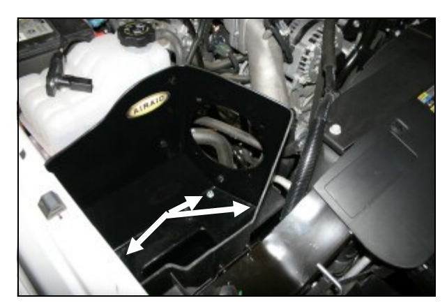
4. Install the Airaid Cool Air Box (CAB) (#3) into the vehicle as shown, replacing the factory air filter. Install three M6-1 x 25mm bolts (#9), and three flat washers (#7) thru the bottom of the CAB and into the factory captured nuts. Leave the bolts loose for now. Apply the Airaid Bubble Decal inside the Airbox as shown