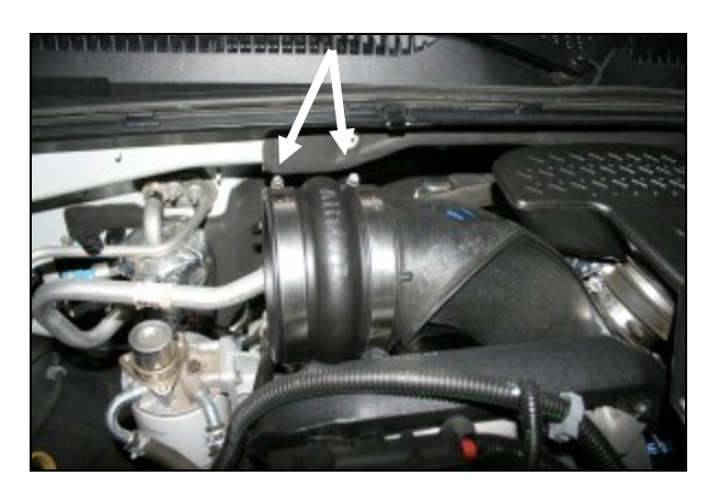
5. Install two #72 hose clamps (#10) onto the urethane hump hose (#4), and then slip the hump hose onto the end of the factory turbo intake tube as shown. Leave the clamps loose for now.