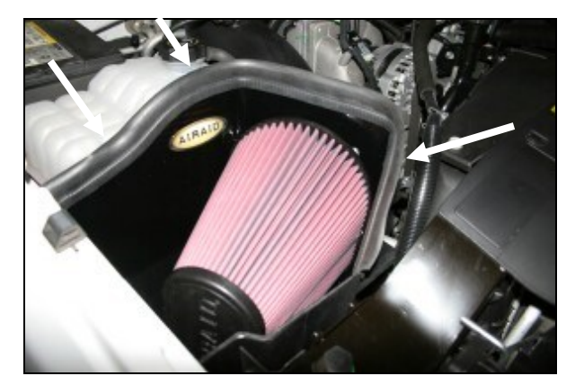
8. The Airaid Premium filter (#1) is a very tight fit in the CAB . For ease of installation, hold the filter in your right hand, and guide the bottom of the filter past the flange of the tube with your left hand inside of the CAB . It will fit! Tighten the hose clamp. Next install the weather strip (#5) on top of the CAB , starting at the fender and working your way towards the radiator.