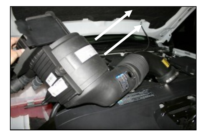
2. Rock the air filter housing back and forth while lifting up, and remove the factory intake assembly from the vehicle. There are only grommets holding it in place.