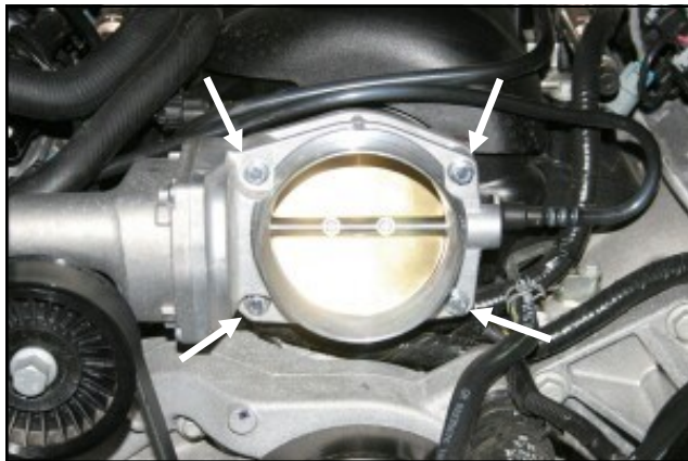
5. Install the provided bolts and washers thru the throttlebody, gasket, and Poweraid Spacer and tighten to the manufacturer's specifications.