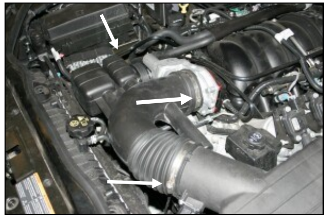
6. Reinstall the intake tube, tighten the two hose clamps, and reconnect the crankcase breather tube. Reinstall the beauty cover, and oil cap in the reverse order that they were removed. Re-connect the negative battery cable!