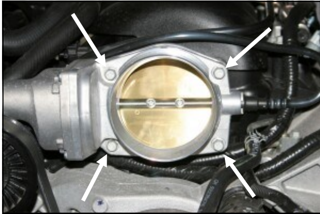
3. Remove the four bolts that secure the throttlebody to the intake manifold.