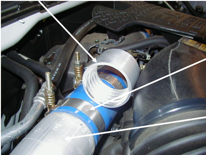
Ref. "A" - Power Plate