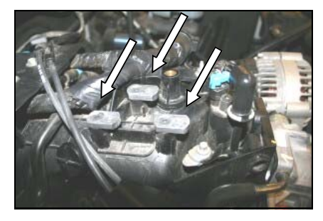
5. Install three 1/2" extension plates (#5) using the provided flat head countersunk bolts(#6). Point the long end towards the radiator, and snug them down.