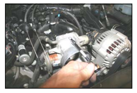
3. Using a 4mm socket, remove the three studs that hold the throttle body to the intake manifold. No need to remove the throttle body, leave it hang where it is.

1. Disconnect the negative battery cable! Loosen one bolt and remove the beauty cover. Pry the tube from the clamp on the radiator hose. Loosen the hose clamps on each end of the intake tube and remove the tube.