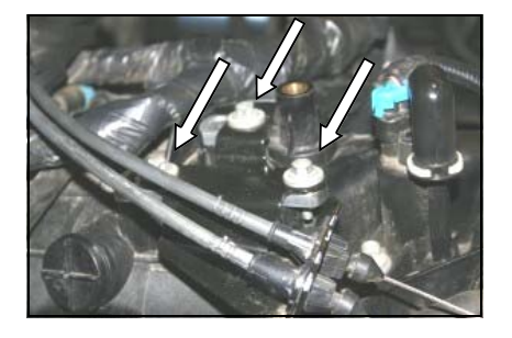
8. If you have an electronic throttlebody, (no cables) skip to step #10. Re-install the throttle cable bracket and the 3 factory bolts removed in step 4. Some minor adjustments to the extension plates may be necessary to get all three bolts to be aligned in position.