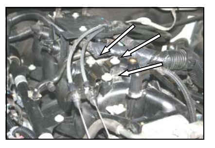
4. If you have an electronic throttlebody, (no cables) skip to step #6. Using a 5/16" socket, remove and save 3 bolts that hold the throttle cable bracket to the intake manifold. ( Disregard steps #4, #5, and #8, if you are working on a 8.1L ).

2. Using a 10mm socket, remove the three nuts that hold the throttle body to the intake manifold.