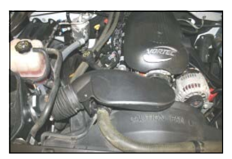
10. Re-install the intake tube and tighten the hose clamps. Re-install the plastic holder from step #1.

Re-install the beauty cover and bolt. Re-connect the negative battery cable!