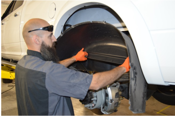
(Fig. 1) Some vehicles may require the removal of the fender liner and perhaps the left rear wheel so as to facilitate access to the tank fill and vent hoses.

vehicles may require the removal of the left rear fender liner and even the wheel to facilitate access to the tank fill and vent hoses (See Fig. 1).