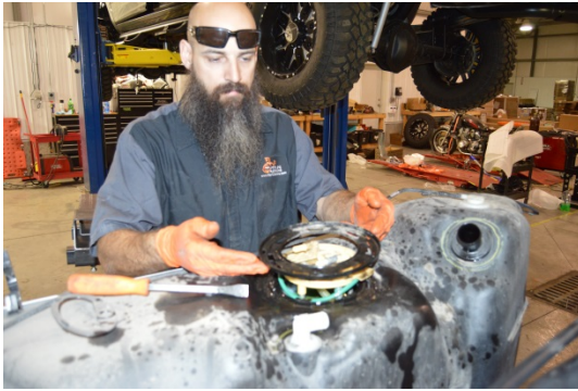
(Fig. 2) Loosen the hold-down ring on the OEM tank by turning counter-clockwise. Note where the connections on your vehicle's sending unit are "clocked" and install so they are located in the same position in the new tank.