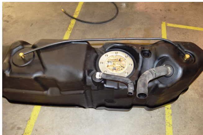
(Fig. 5) Photo shows the fill and main vent hoses transferred and installed on new TITAN tank. Note the 5/16" hose between the two rollover valves. The small line from the vehicle's fill spout will attach to the tee in this line. The tab on the sending unit lines up with the "TAB LOCATOR" marks on the tank body.