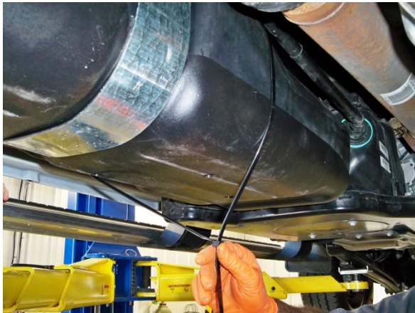
(Fig. 6) If the optional Custom Shield is installed be sure to use the included Quick Tie to hold the shield securely to the front section of the tank as shown here. Install about 7 inches in front of front strap. Trim any excess Quick Tie