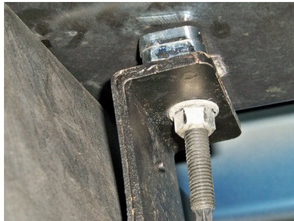
(Fig. 7) Tighten the bolt and bracket against the shims. If the strap does not hold the tank tightly enough, remove one shim at a time until it is tight.