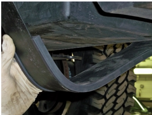
(Fig. 4) If optional TITAN Shield is not to be installed, install rubber bushings (pn 99 0000 0103) on both straps with the channel side toward the strap.