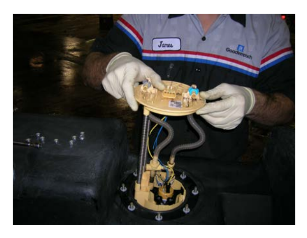
(Fig. 3) Carefully place sending unit into the TITAN™ fuel tank on top of "O" ring gasket.