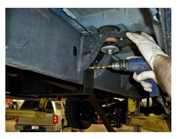
(Fig. 10) This shows the "S" Bracket Support bolted to the cab mount below the driver's door. As shown, drill a hole through the vertical center-hole of the bracket and fasten with the bolt provided.