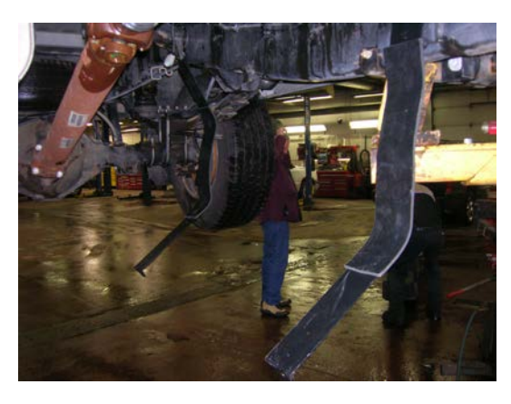
(Fig. 7) Carefully bend straps down out of the way in preparation for lifting tank into place.