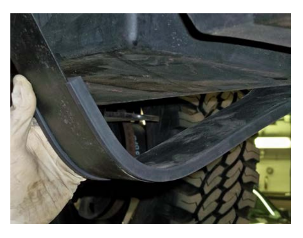
(Fig. 6) If TITAN™ Shield is NOT to be installed with the tank, then install Rubber Strap Bushings in tank mounting strap. Center the bushings in the bottom of the straps.