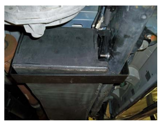
(Fig. 12) Photo shows the "S" Bracket Support installed at the front of the tank.