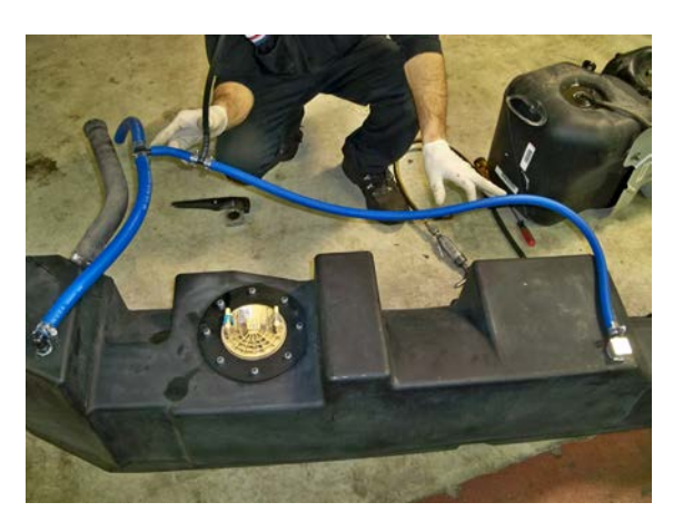
(Fig. 5) This shows final configuration for vent line system. Vent line on side of Vent Kit Assembly farthest from ¾" vent line should be left loose as it will not be connected permanently until tank is lifted into place and ½" vent line hose is threaded over the top of the truck frame. Vent system and fill hose is seen as follows (starting at the photo's right side and working counter-clockwise): 1) Rollover Vent valve 2) ½" x 38" vent line hose 3) Vent Kit Assembly 4) ½" x 5" section of hose 5) ¾" x ¾" x ½" Reducing Line Tee Connector 6) ¾" x 4" vent line hose at top of photo 7) ¾" x 17" between ¾" x ¾" x ½" Reducing Line Tee Connector and elbow 8) Elbow for vent line on top of tank. Some year-to-year model differences may require additional trimming of hoses for the best fit.