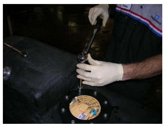
(Fig. 4) Tighten nylon locking nuts on the top flange to 20 ft. lbs of torque. Tighten in a "star" pattern.