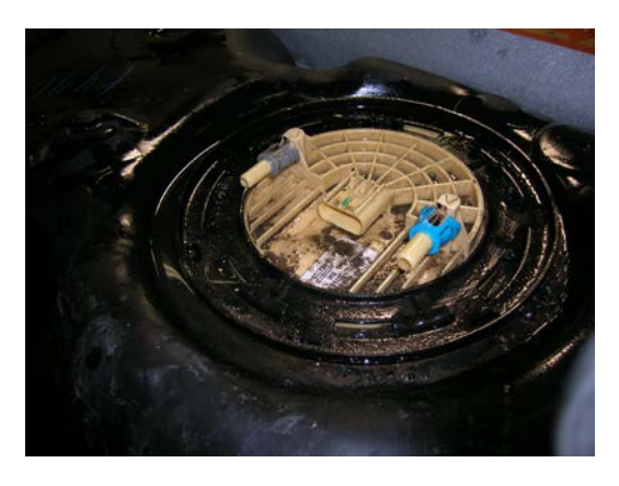
(Fig. 2) Be sure to clean the sending unit and surrounding area before removing sending unit.