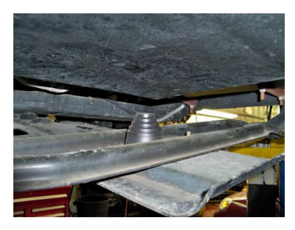
(Fig. 9) This photo shows the Cushion Mount installed on the factory skid plate below the tank.