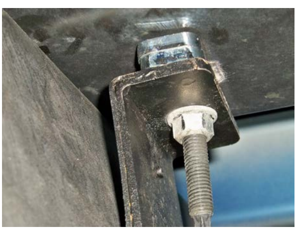
(Fig. 13) Thread two shims onto each strap bolt. (Fig. 14) Tighten the bolt and bracket against the shims. If the strap does not hold the tank tightly enough, remove one shim at a time until it is tight.

Note: The shims are included to make it easier for the installer to adjust the straps so they are good and tight. This is to compensate for slight differences from vehicle to vehicle and year to year. With two shims in place on each strap, tighten the mounting bolts. If the straps are not sufficiently tight, remove one shim at a time until the straps hold the tank tightly.