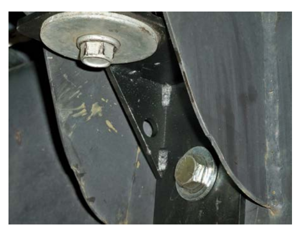
(Fig. 11) As an alternative to drilling the frame, the cab mount gussets can be drilled in-line with the "S" Bracket gussets and bolted into place. See the holes in the bracket gussets shown above.