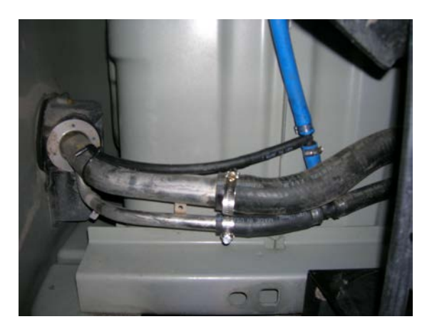
(Fig. 8) Photo shows final installation of fill hose and vent line hoses on vehicle's fill spout. Note the ¼" Vent Kit Assembly hose is securely fastened to the fill spout. The ¼" vent is necessary to prevent vacuum build-up in your TITAN™ fuel tank.