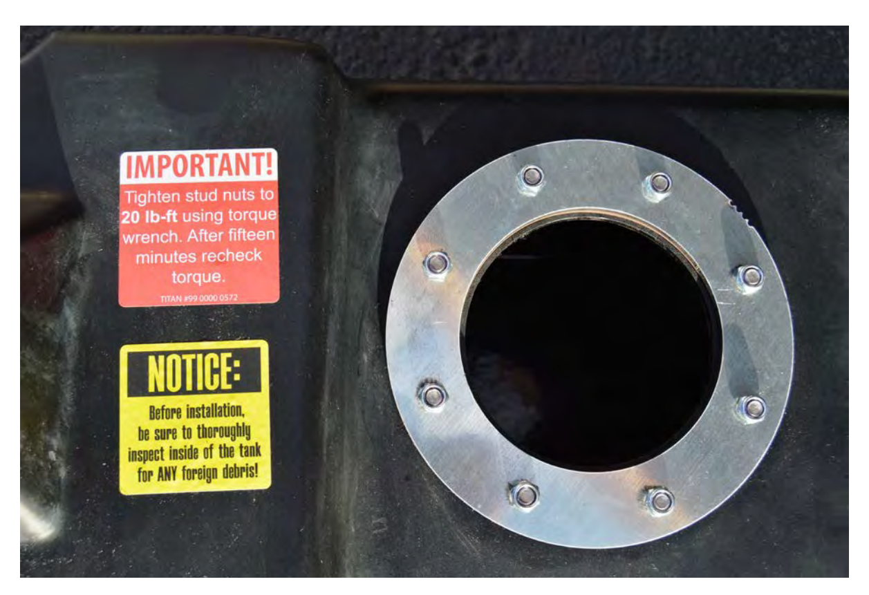
(Fig. 7) The sending unit top flange and installation notices are shown here.

Note: On long bed tanks only: On <u>some</u> tanks the 3.25" long (see parts list above) fill hose extension may be required to reach the vehicle's fill spout. IF you know for sure it is required on this vehicle, you may want to cut the fuel tank fill hose and fit the fill hose extension before mounting the tank. Cut the original equipment fuel tank fill hose in the center of its middle straight section and fit the fill hose extension into the tank side's hose. Install this hose on the Titan tank.