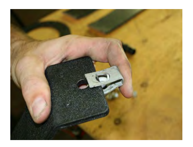
(Fig. 1) Remove threaded clip from original equipment tank's front strap and install on the Titan tank's front strap.

Note: Some truck models may be equipped with a wiring harness for gooseneck and 5<sup>th</sup> wheel trailers. This will need to be moved to a new location and secured once the new tank is installed—generally behind the tank is best.