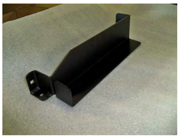
(Fig. 2) Skid Plate Nose Bracket in "low" position.