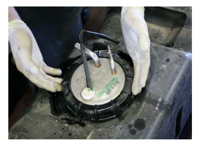
(Fig. 2) Remove the sending unit from the original equipment tank by rotating the hold-down ring counter clockwise.