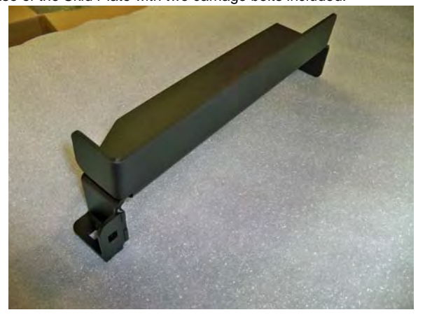
(Fig. 3) Skid Plate Nose Bracket in "high" position.