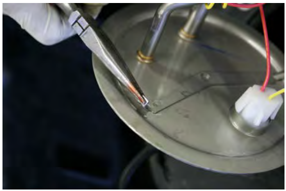
(Fig. 3) Leave the "O" ring gasket, studs and retainers assembled as they are (shown before sending unit, top flange, and 3/8" nylon locking nuts are installed).