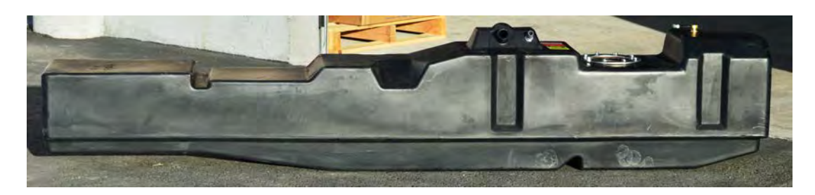
Extended Capacity Replacement Tank for FORD Diesel Trucks

For Ford truck models F250 & F350 1999-2010: Crew Cab Short and Long Bed 7020299(S) Short Bed (1999-2007), and 7020208(S) Short Bed (2008-2010) 7020399(S) Long Bed (1999-2007), and 7020308(S) Long Bed (2008-2010)