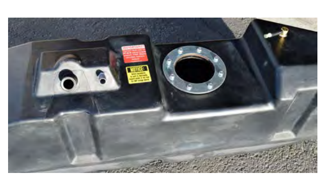
(Fig. 10) Install the OEM 1 ½" fuel tank fill hose to the large king nipple and the ¾" OEM vent hose to the smaller nipple. Be sure to fasten tightly with the OEM hose clamps.