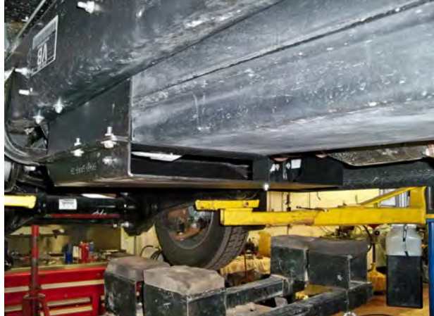
(Fig. 5) Formed channel is bolted to the inside of the frame on the driver's side.