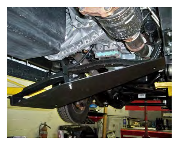
(Fig. 4) Attach the Skid Plate to the bottom of the passenger side of the frame first, leaving the bolts loose. Make sure the Nose Bracket is on the edge of the Skid Plate closest the rear of the vehicle.

Using the 5/16" cap screws, washers, and nylon locking nuts, attach the Skid Plate to the passenger side of the frame first, leaving the bolts loose (Fig. 4).