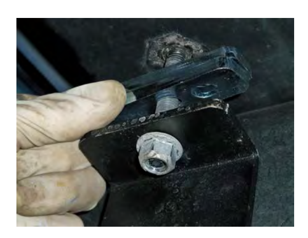
(Fig. 8) Thread two shims onto each strap bolt.