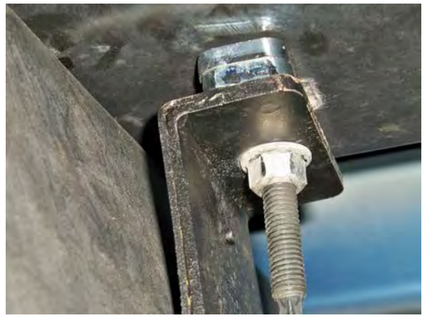
(Fig. 9) Tighten the bolt and bracket against the shims. If the strap does not hold the tank tightly enough, remove one shim at a time until it is tight.