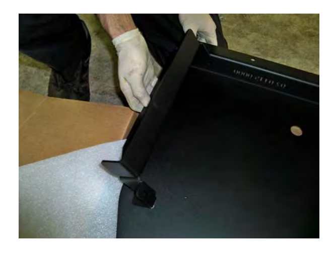
(Fig. 1) The Skid Plate Nose Cradle Bracket attaches to the base of the Skid Plate with two carriage bolts included.