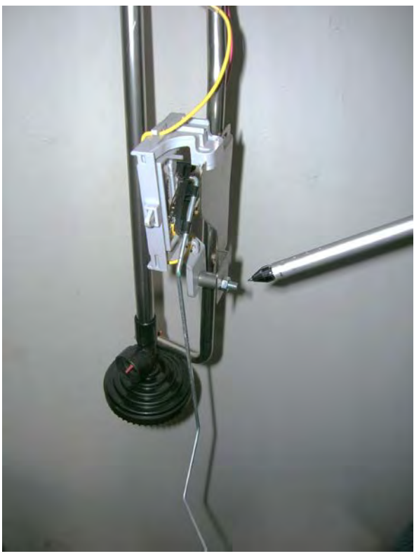
(Fig. 6) Level sensor has been removed and turned so as to face toward the rear of the truck when installed in the fuel tank. It is secured with pan-head screw, spacer (either steel or nylon) and nut. Pointer is indicating position of screw, nut and spacer.