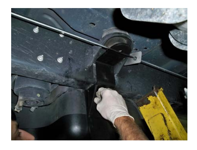
(Fig. 11) Mount the upper piece of the assembly to the lower piece using bolt provided.