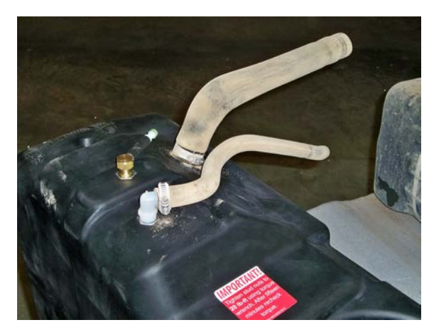
(Fig. 6) Install fill and vent hoses from original equipment tank on TITAN tank as shown. Make sure that 3/4" vent line is lined up with orientation mark on the tank.