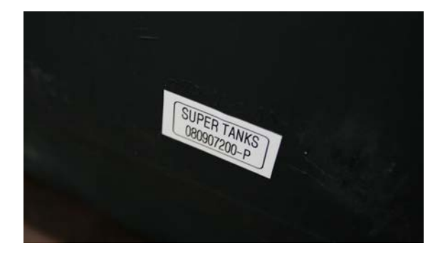
Warranty is void if product is improperly installed.

A tank must be registered within sixty (60) days of receipt for the warranty to be valid.