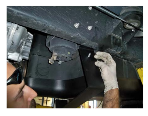
(Fig. 9) Hang lower piece of support assembly on lower lip of vehicle frame and slide towards the rear of vehicle until it lines up with cab mount.