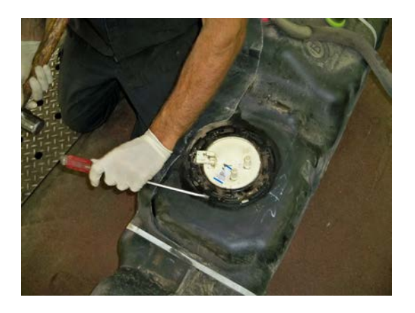
(Fig. 2) Loosen hold-down ring on original equipment tank by tapping counter-clockwise, remove and lift out sending unit.

The new TITAN fuel tank comes with the sending unit mounting hardware assembled. Remove the 3/8" nylon lock nuts from the studs holding the top flange. Remove the top flange. You will see the "O" ring gasket in place under the flange. Leave the "O" ring gasket, studs, and retainers assembled as they are (See Fig. 3)