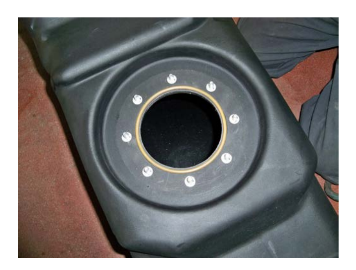
(Fig. 3) Leave the "O" ring gasket, studs and retainers assembled as they are (shown before sending unit, top flange, and 3/8" nylon locking nuts are installed).

The new TITAN fuel tank comes with the sending unit mounting hardware assembled. Remove the 3/8" nylon lock nuts from the studs holding the top flange. Remove the top flange. You will see the "O" ring gasket in place under the flange. Leave the "O" ring gasket, studs, and retainers assembled as they are (See Fig. 3)