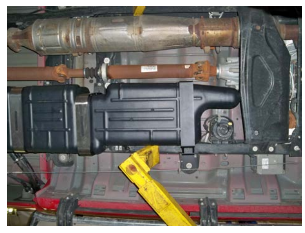
Underside view of TITAN 2011 Crew Cab Long Bed tank (7020311) with shield installed in an F450.