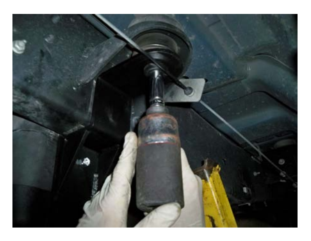
(Fig. 12) Replace cab mount bolt with its existing washers and tighten to factory specification.