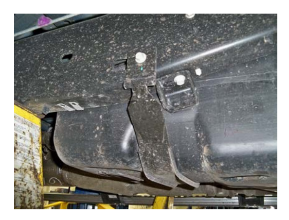
(Fig. 1) Remove original equipment strap and "bumper bracket", shown here to the right-hand side of the front strap.