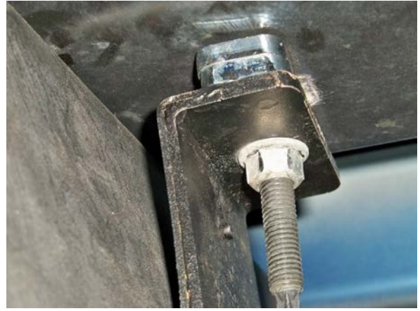
(Fig. 8) Tighten the bolt and bracket against the shims. If the strap does not hold the tank tightly enough, remove one shim at a time until it is tight.

The "02 0118 0000 FORD, Front Tank Support Assembly" supports the front of the tank. It is made up of two major pieces: an upper and a lower. Hang the lower piece on the inside bottom lip of the vehicle's frame. Slide it toward the rear of the vehicle until it lines up with the closest cab mount. Loosen the bolt from the cab mount and complete installation of the upper piece as shown in Figs. 9 -12. If mounting the tank without a shield, be sure to place a flexible strap bushing on the bearing surface of the lower piece under the tank.