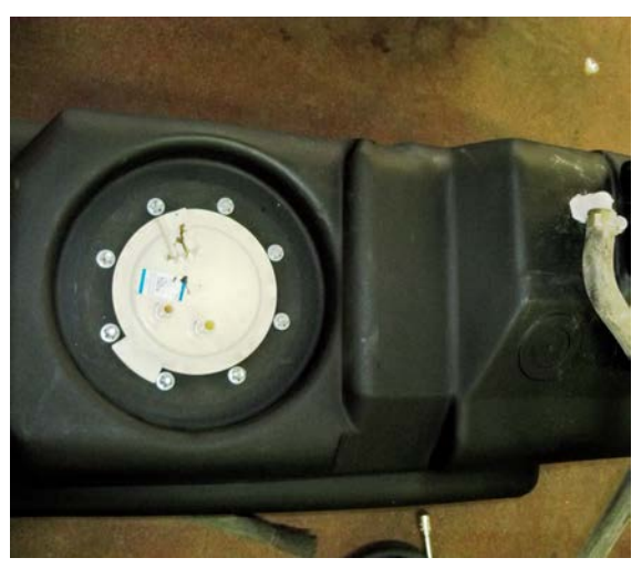
(Fig. 4) Be sure the sending unit is "clocked" the same as in the original equipment tank.