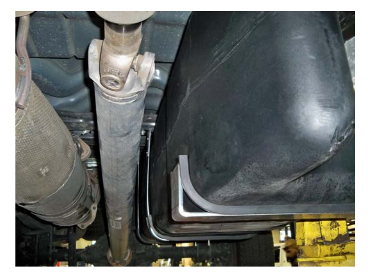
(Fig. 14) Installation of front support on tank without TITAN Shield. Note the flexible bushings on the support and the straps.