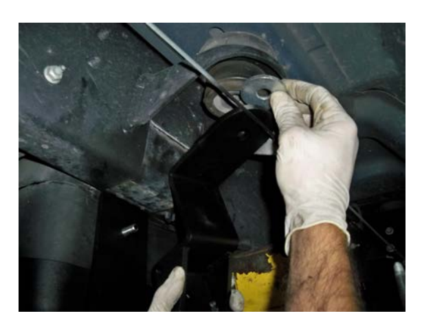
(Fig. 10) Place the supplied fender washer into the center of the rubber cab mount above the upper piece of the assembly.