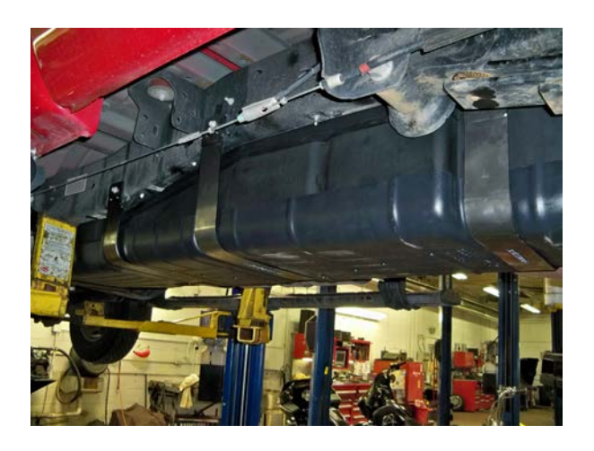
TITAN 2011 Ford Crew Cab, Long Bed tank (7020311) installed showing three straps.