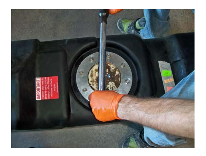
(Fig. 5) Using a torque wrench, tighten the top flange nuts to 20 lb-ft using a "star" pattern.