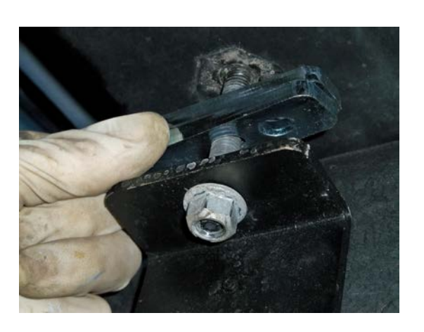
(Fig. 7) Thread two shims onto each strap bolt.