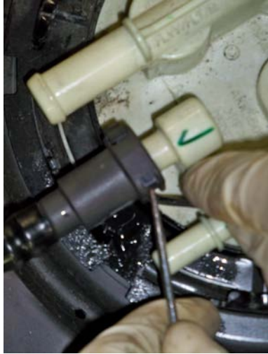
(Fig. 1) Disconnect fuel lines at the sending unit using pick.