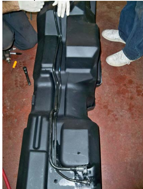
(Fig. 8) Attach the fuel lines to the sending unit and lay them in the retaining groove provided on the top of the replacement tank.