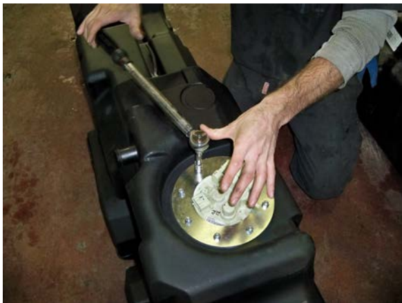
(Fig. 7) Using a torque wrench, tighten the top Flange nuts to 20 ft. lbs. using a “star” pattern.