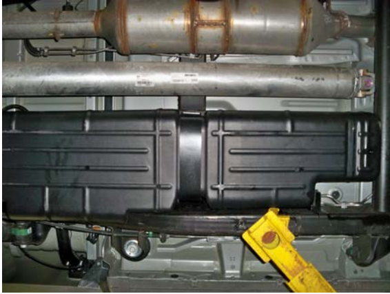
(Fig. 17) 7010211 Installation showing optional TITAN Shield.