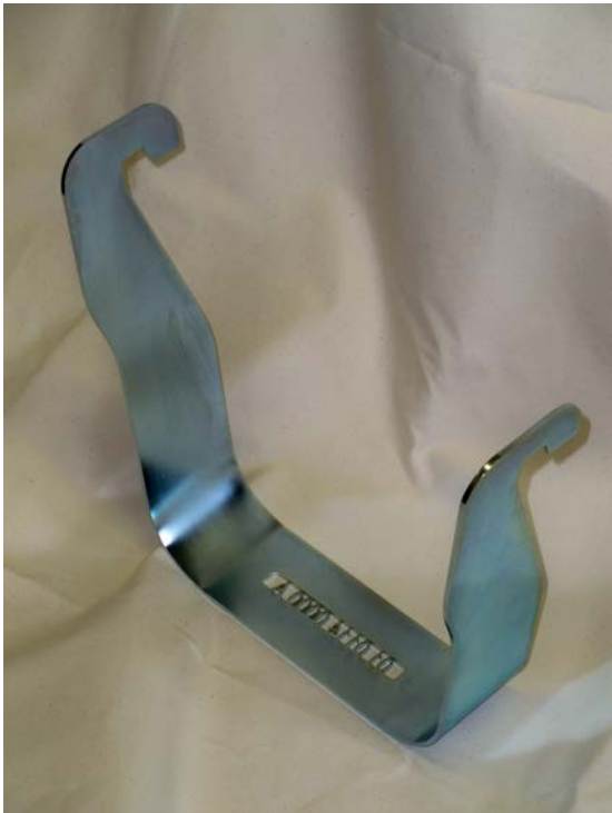
(Fig. 15) Hanger Bracket from 029909 (TITAN PN. 01 0114 0000) GM Long Bed Front Support Kit. For 7010311 when tanks installed on Crew Cabs.