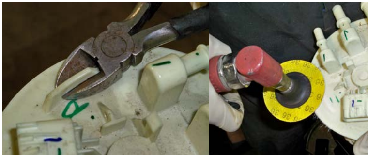
(Fig. 4) If sending unit is equipped with curved ribs on the top, either shave approximately 1/16" off the outside surface of both, or remove the rib closest to the electrical plug using dikes and a