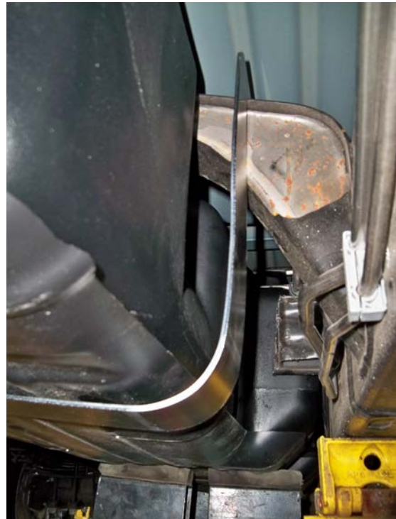
(Fig. 16) Hanger Bracket installed on frame cross-member. Since a TITAN Shield is used no bushing is installed.