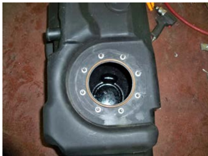
(Fig. 3) Leave the "O" ring gasket, studs and retainers assembled as they are (shown before sending