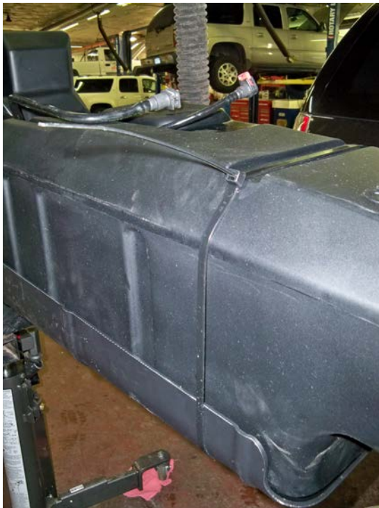
(Fig. 11) Use Quick Tie to fasten shield at front of tank at indentations. Cut off extra.