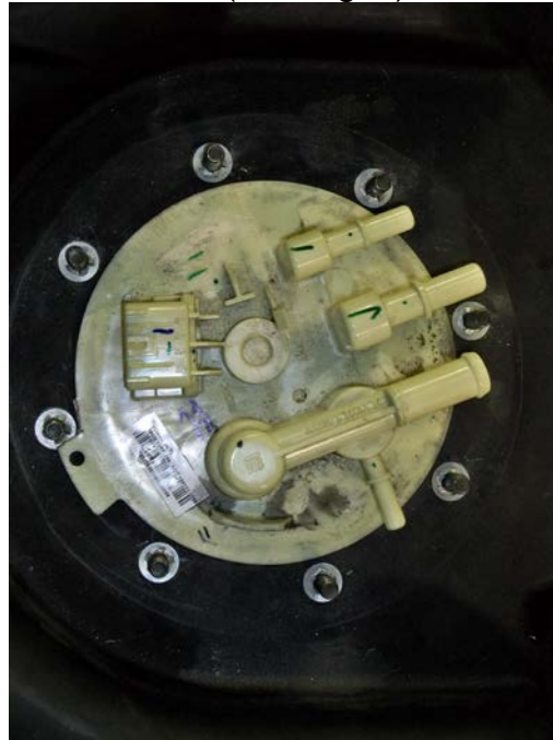
(Fig. 6) Be sure the sending unit is "clocked" nearly the same as in the OEM tank. If the tab was trimmed as in Fig. 5, place the sending unit and rotate it slightly more clockwise until it clears the studs as shown.