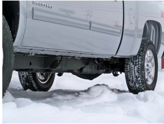
(Fig. 18) Installation Complete!