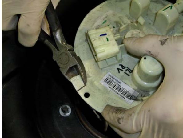
(Fig. 5) If sending unit connections interfere with the mounting studs, trim 1/2" off the side of the tab nearest the electrical connector.