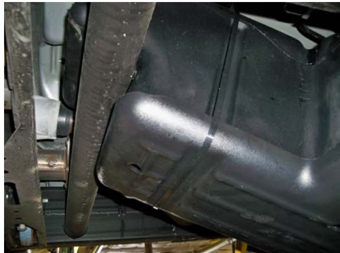
(Fig. 12) Angle front of tank up and over round tubular steel cross member.