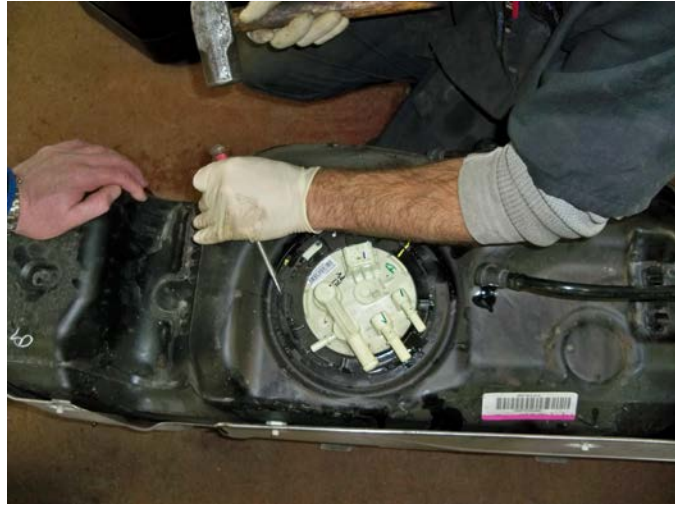
(Fig. 2) Loosen hold-down ring on OEM tank by tapping counter-clockwise, remove and lift out sending unit.