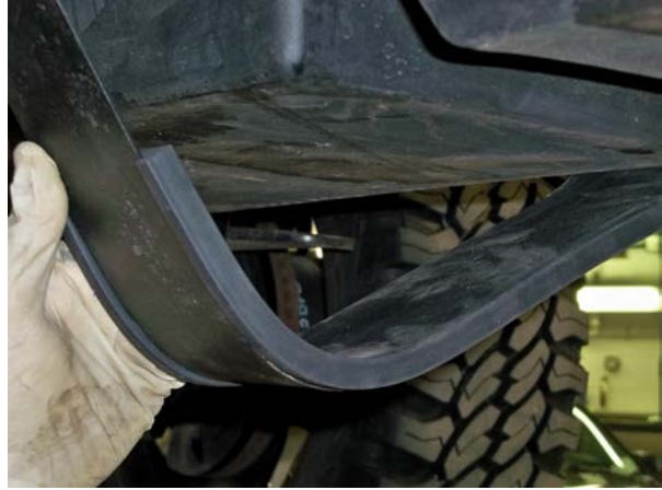
(Fig. 14) Rubber bushings installed on straps when optional TITAN Shield is not used.