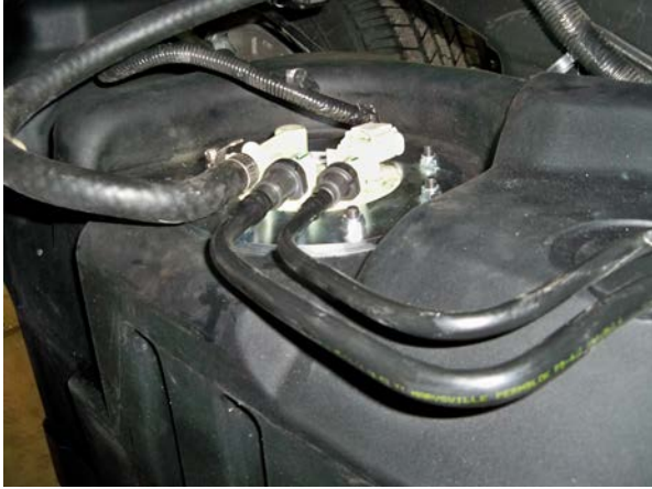
(Fig. 13) Lift tank high enough to reconnect electrical cable and vent hose to sending unit.