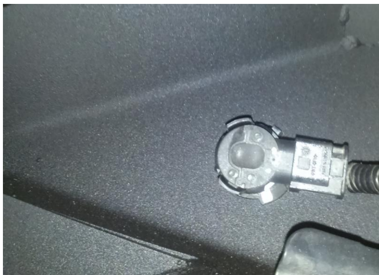
Figure 6a (inner passenger side: plug toward center of bumper)