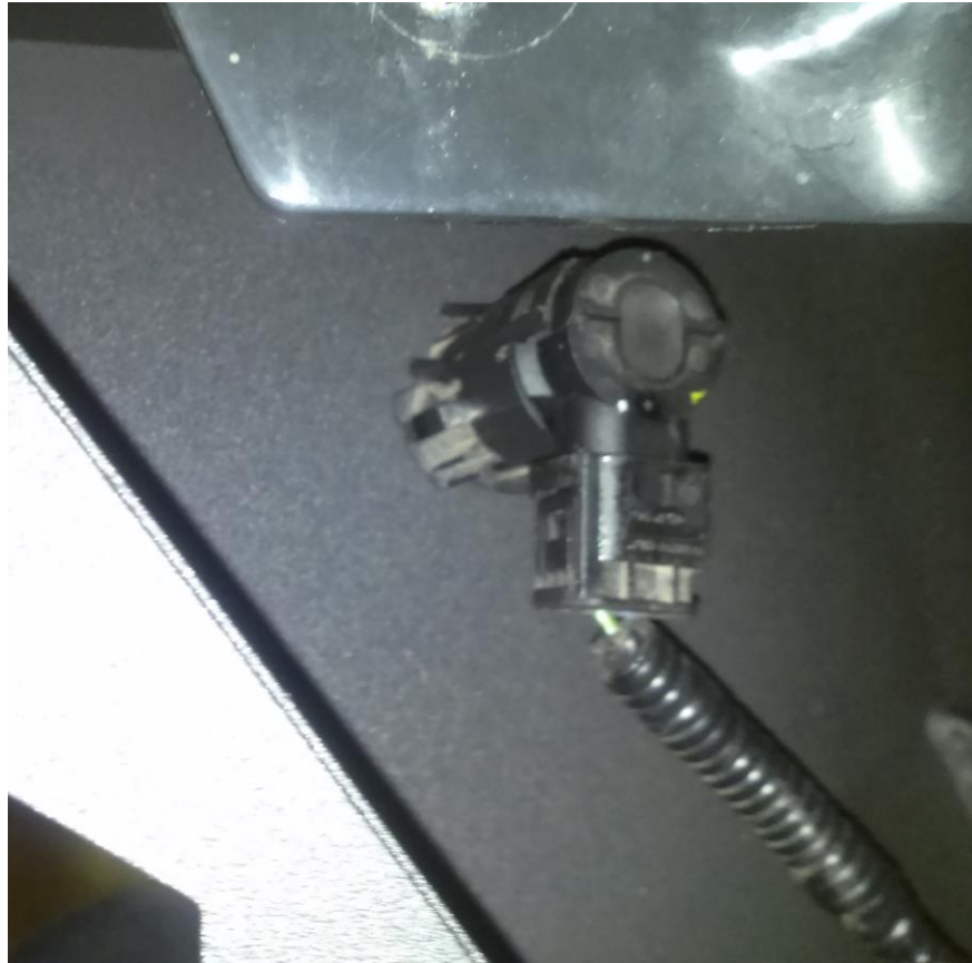
Figure 6b (outer passenger side: plug toward ground)

Product Number: E1751 Application: 10-14 Ford Raptor 2009-2014 F150