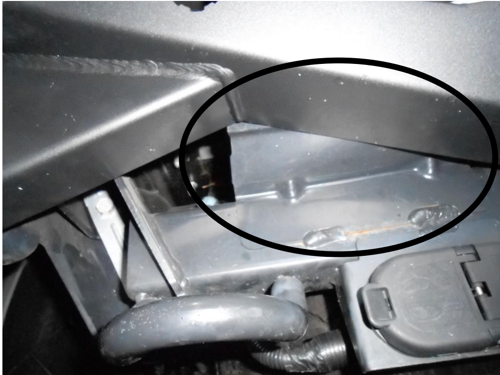
Figure 3 (image of bumper and hitch installed)

Product Number: E1751 Application: 10-14 Ford Raptor 2009-2014 F150