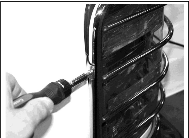
FIG. 4 4mm screw installs through front bracket into threaded insert in guard

FIG. 3 Stock taillight mounting screws reinstall through inside brackets.