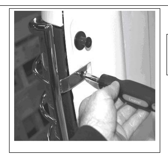
FIG. 3 Stock taillight mounting screws reinstall through inside brackets.