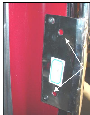
Optional Drilling Locations

Cleaning Instructions: For stainless steel, an aluminum polish may be used to polish small scratches and scuffs on the finish. Mild soap, window and glass cleaner may be used to clean stainless steel. For gloss black: Mild soap, window and glass cleaner may be used. Do not use any type of polish or wax that contains abrasive that could damage the finish.