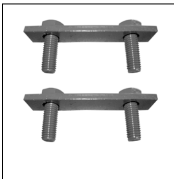
Bolt Plates ( The picture only for reference)