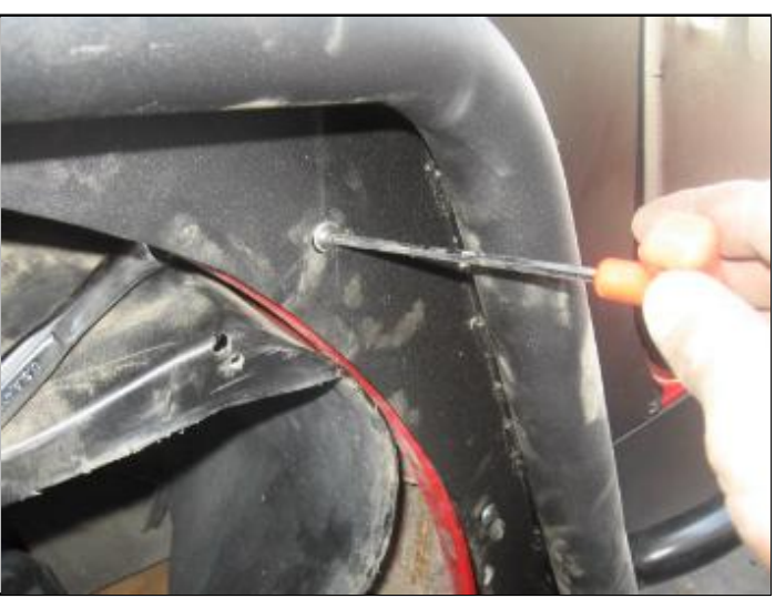
Step 2. Insert bolts through flare and jeep body and hand tighten with lock nuts. (You may need to pull inner fender liner down to gain access to the back of the bolts to install the nuts)