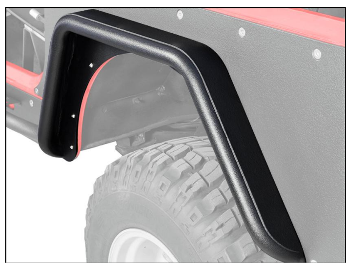
Step 3. Installation is complete, repeat same steps for opposite side.