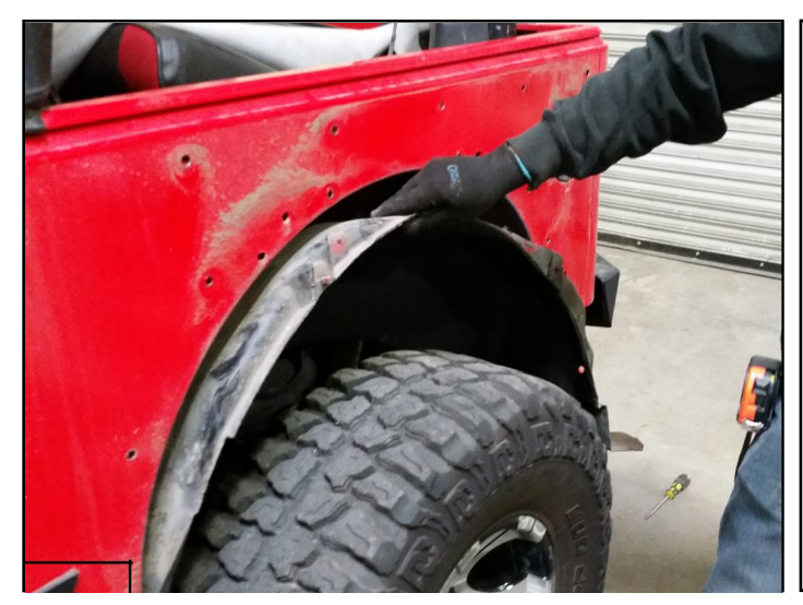
Step 1. Pull back the plastic inner fender liner. Remove the (8) - 8 mm screws holding the fender are to the body. Insert the adjustable wrench behind the body to hold the square plastic nut while removing the 8mm screw with a socket wrench.