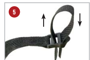
Ribs on buckle should face up. Thread strap through buckle as shown.