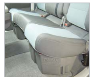
This is how the DU-HA should look installed under the back seat.