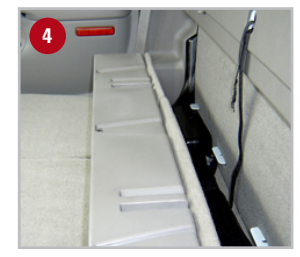
The DU-HA bolts to rear floor flaps to allow access to jack when tilted forward.