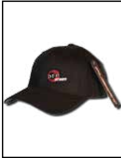
aFe Power Hat