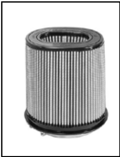
Pro DRY S Air Filter