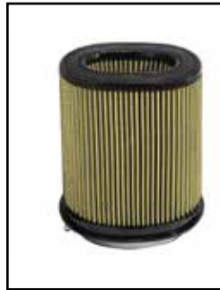
PRO GUARD 7