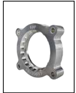
Throttle Body Spacer