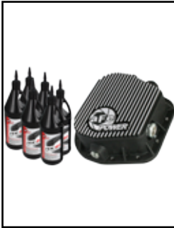
Rear Differential Cover