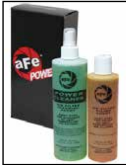
Gold Squeeze Restore Kit