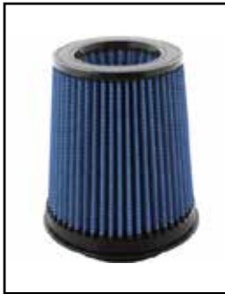
Pro 5R Air Filter