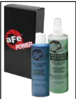
Blue Squeeze Restore Kit