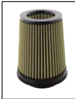
Pro-GUARD 7 Air Filter