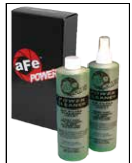
Pro DRY S Restore Kit