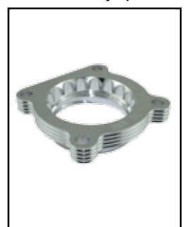
Throttle Body Spacer