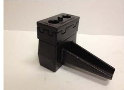
2.0" REAR LIFT OPTION

IMPORTANT! THIS IS A PATENTED, INTERLOCKING SYSTEM DESIGNED ONLY TO BE USED ALONE OR WITH THE ORIGINAL OE LEAF SPRING BLOCKS REMOVED FROM THIS VEHICLE. SECURING THIS KIT TO THE BOTTOM OF THE OE BLOCK, AS SHOWN, WILL ASSURE PROPER OE BUMP STOP SPACING AND SAFETY AFTER REINSTALLATION.