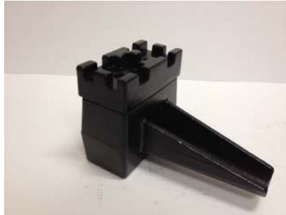
1.5" REAR LIFT OPTION