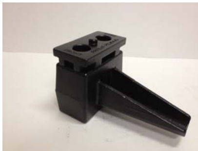
1.0" REAR LIFT OPTION

Step 8: Determine whether you want a 1.0", 1.5" or 2.0" rear lift, and orient the components according to the images shown below to achieve your desired ride height.