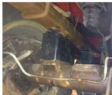
1.5"(2.25") REAR LIFT OPTION