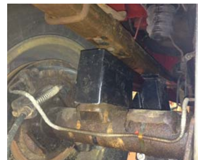
2.0"(2.75") REAR LIFT OPTION

IMPORTANT! THIS IS A PATENT PENDING, INTERLOCKING SYSTEM AND SHOULD NEVER BE STACKED OR USED WITH ANY OTHER LEAF SPRING BLOCKS AS IT MAY CAUSE AN UNSAFE CONDITION FOR BOTH THE INSTALLER & THE VEHICLE DRIVER.