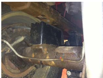
1.0"(1.75") REAR LIFT OPTION

Step 8: Determine whether you want a 1.0", 1.5" or 2.0" rear lift ( 2007-Up Models 1.75", 2.25" or 2.75" ), and orient the components according to the images shown below to achieve your desired right height. IMPORTANT! Be sure that the SHORTER end of the large tapered interlocking block is positioned FORWARD , toward the FRONT of the vehicle.