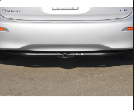
For more information log onto www.curtmfg.com, & for helpful towing tips log onto www.hitchinfo.com