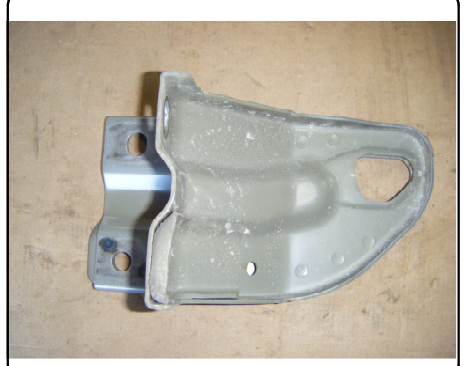
For more information log onto www.curtmfg.com, & for helpful towing tips log onto www.hitchinfo.com