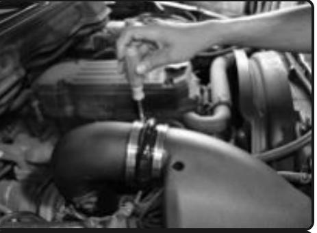
16. Connect the lower part of the Injen tube to the 4.00" coupler on the turbocharger inlet. Then connect the top of the tube to the plenum and slide the 4.50" hump hose over and secure all clamps.

Congratulations! You have just completed the installation of this intake system. Periodically, check the alignment of the intake, normal wear and tear can cause nuts and bolts to come loose. <u>Note: Check clearance and</u> <u>adjust if needed! Failure to check the</u> alignment and adjust the intake can