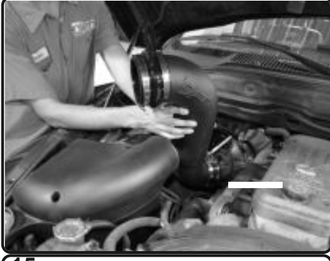
15. Drop the Injen intake tube into the engine bay.