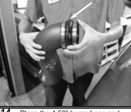
14. Place the 4.50" hump hose and two #72 clamps onto the 4.50" end of the Injen intake tube. Make sure you slide the hump hose as far back as you can.

13. Place the three M8X25mm bolts and one M8X80mm bolt to the top of the plenum illustrated by the photo and then secure the allen bolts