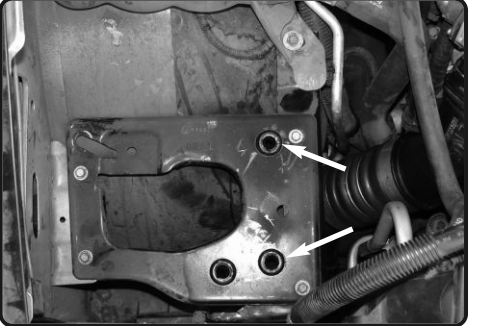
10. The factory air box assembly bracket is shown in the photo. Arrows indicate the grommets where the Injen air box mounts will go.