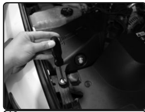
16. Reuse the factory 8mm bolt and secure the Injen air box bracket to the passenger side headlight bracket.