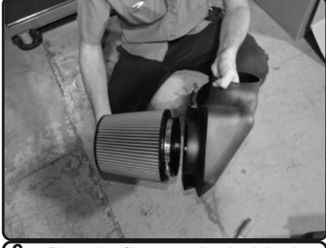
6. Place the filter onto the the Injen intake plenum and then secure the clamp.