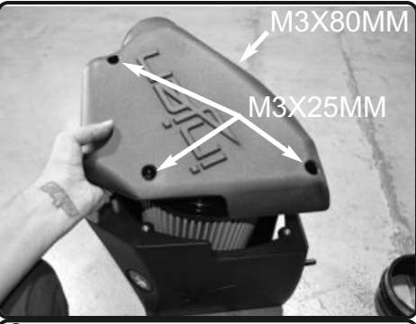
8. Place the three M6X25mm bolts and one M6X80mm into the plenum illustrated by the photo. Your Injen air box assembly is now complete.