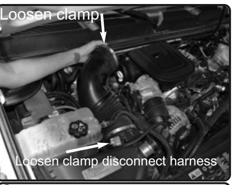
2. Disconnect the MAF sensor harness. Loosen the clamp on the intake duct and then remove entire air duct