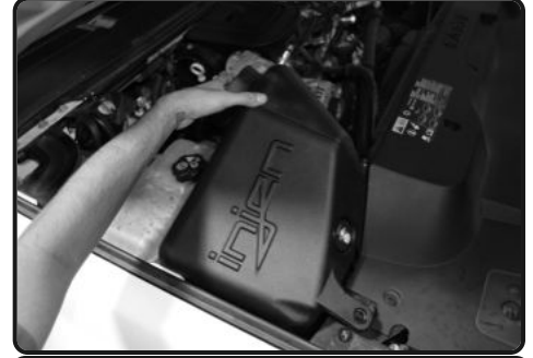
11. Lower the Injen air box into the engine bay. Make sure the pegs under the Injen air box goes into the factory air box grommets on the air box tray from figure 10