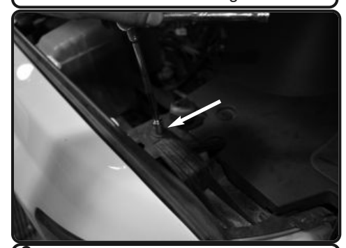
9. Remove the 10mm headlight bracket bolt on the passenger side head light. The Injen air box assembly will bolt up to this bolt.