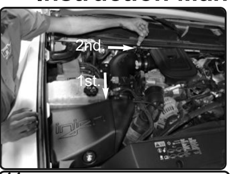
14. First slide the big end of the intake pipe into the 5.0" hump hose on the air box plenum. Then slip the smaller end into the 4.25"-4.50" step hose on the turbo inlet. Once intake is adjusted, tighten all clamps.