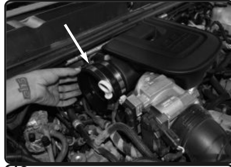
12. Place the 4.25"-4.50" step hose and two #72 clamps onto the turbo inlet. Tighten the clamp on the turbo inlet side for now.