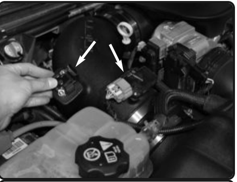
15. Place both MAF sensors onto their appropriate location and then screw them down with the supplied M4 bolts. Reconnect the MAF sensor harnesses