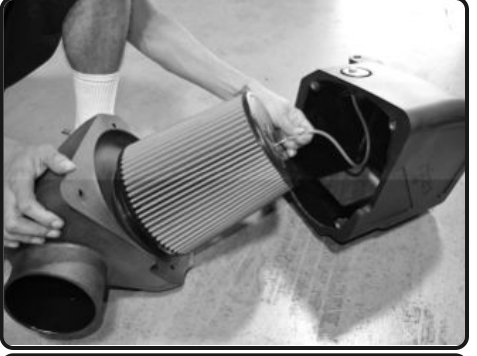
7. Connect the 3mm vacuum hose from figure 6 to the barbed fitting on the filter