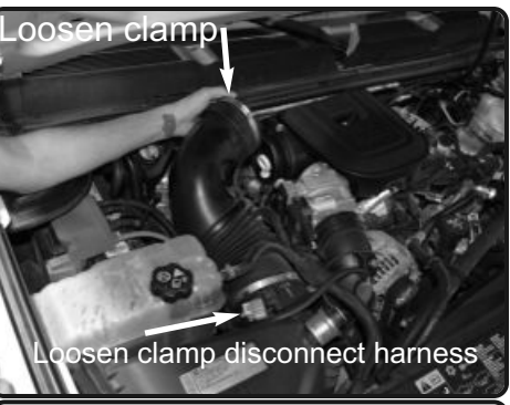
2. Disconnect the MAF sensor harness. Loosen the clamp on the intake duct and then remove entire air duct