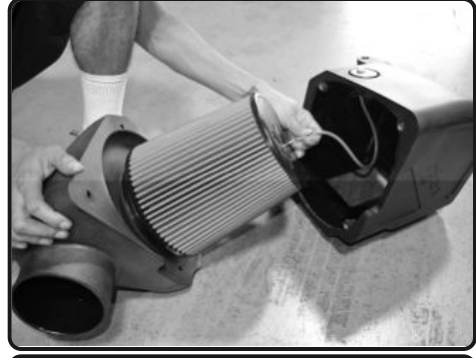
7. Connect the 3mm vacuum hose from figure 6 to the barbed fitting on the filter