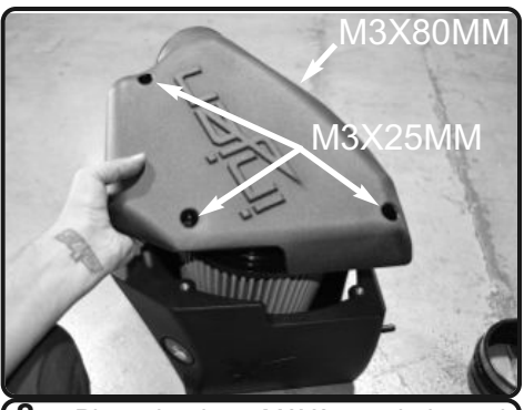
8. Place the three M6X25mm bolts and one M6X80mm into the plenum illustrated by the photo. Your Injen air box assembly is now complete.