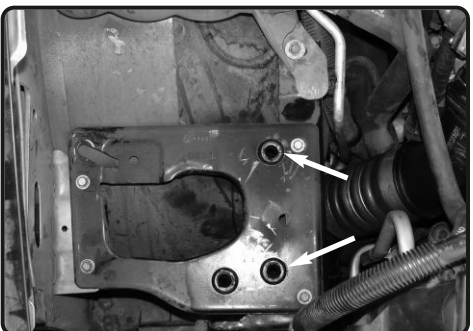
10. The factory air box assembly bracket is shown in the photo. Arrows indicate the grommets where the Injen air box mounts will go.