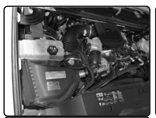
1. Stock intake system shown.