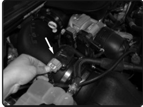
15. Place the MAF sensor onto the intake tube and then secure it with the supplied M4 bolts. Reconnect the MAF sensor harnesse