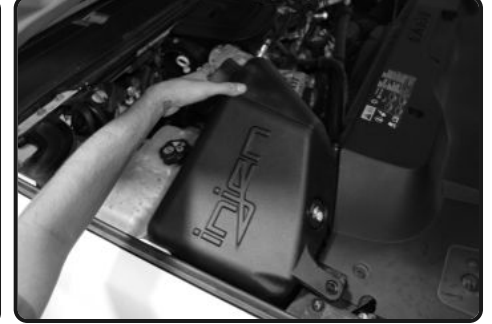
11. Lower the Injen air box into the engine bay. Make sure the pegs under the Injen air box goes into the factory air box grommets on the air box tray from figure 10