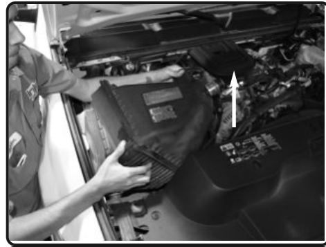
4. Firmly lift up on the stock air box assembly and pull the stock air box assembly out of the engine bay.