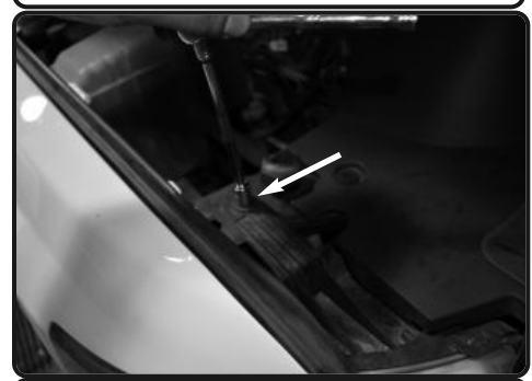
9. Remove the 10mm headlight bracket bolt on the passenger side head light. The Injen air box assembly will bolt up to this bolt.