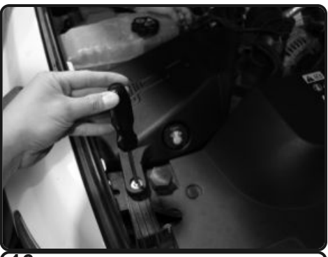
16. Reuse the factory 8mm bolt and secure the Injen air box bracket to the passenger side headlight bracket.