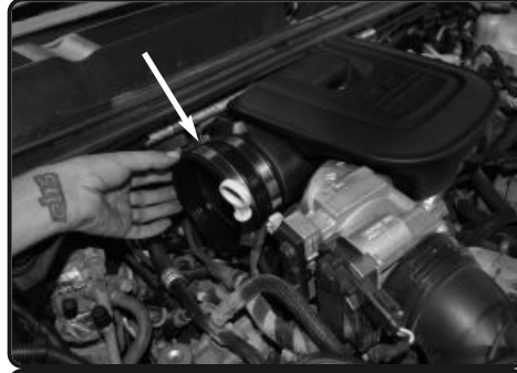
12. Place the 4.25"-4.50" step hose and two #72 clamps onto the turbo inlet. Tighten the clamp on the turbo inlet side for now.