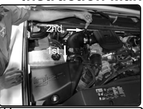
14. First slide the big end of the intake pipe into the 5.0" hump hose on the air box plenum. Then slip the smaller end into the 4.25"-4.50" step hose on the turbo inlet. Once intake is adjusted, tighten all clamps.