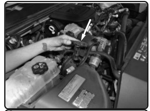
Remove the factory torx screws from the MAF sensor and then remove the MAF sensor from the factoryu air box assembly.