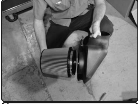
6. Place the filter onto the the Injen intake plenum and then secure the clamp.