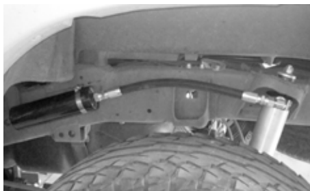
Fig. 6: Driver side rear