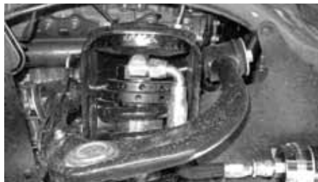
Fig. 2: Passenger side

the vehicle with the provided washers and bolts or nuts (Depending on shock model). Tighten all three bolts or nuts to 24 ft*lbs.