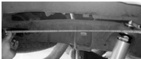
Fig. 5: Passenger side reservoir bracket location rear