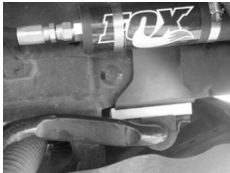
Fig. 4: Passenger side