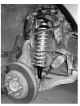
Fig. 2: Passenger side