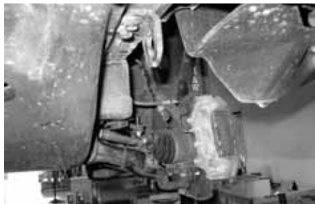
Fig. 3: Driver side