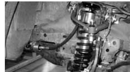
Fig. 2: Driver side

Series models connect the top shock hat to the vehicle using the nuts provided. Tighten all three bolts or nuts to 24 ft* lbs.