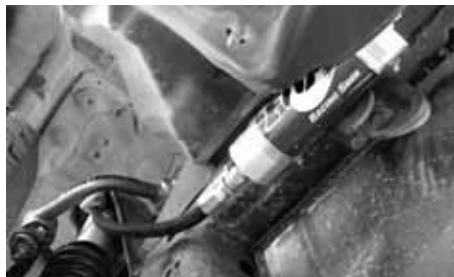
Fig. 4: Passenger side