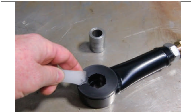
Use assembly lube on bushings and sleeves.