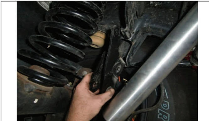
Remove track bar and ReadyLIFT rear drop bracket