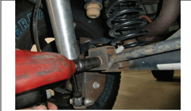
Remove rear track bar bolt at axle.