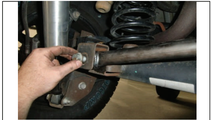
Straight zerk goes on short end and 90 degree on longer end