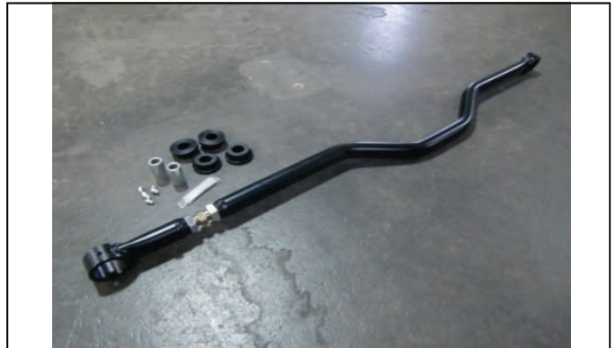
Assemble track bar bushings, sleeves and zerk fittings.