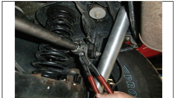
Adjust track bar under rear of vehicle and tighten jam nuts.