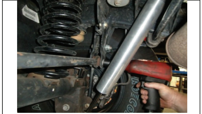
Remove hardware at frame, and drop bracket if necessary.