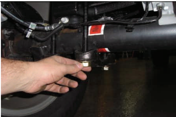
Place lower spring plate onto u-bolts and attach w/ new nuts.