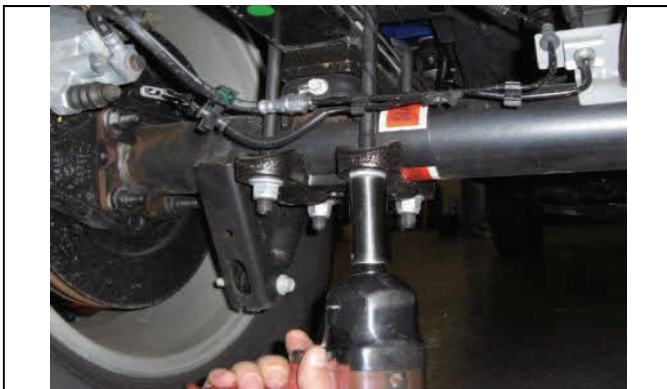
Loosen and remove factory u-bolt hardware.