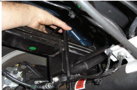
Place new longer u-bolts over leaf spring and axle.