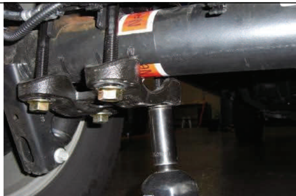
Snug hardware down, lower vehicle on ground and torque.

Recheck all work and test drive. Vehicles with two piece drive shafts may require lowering of the carrier bearing with spacers.