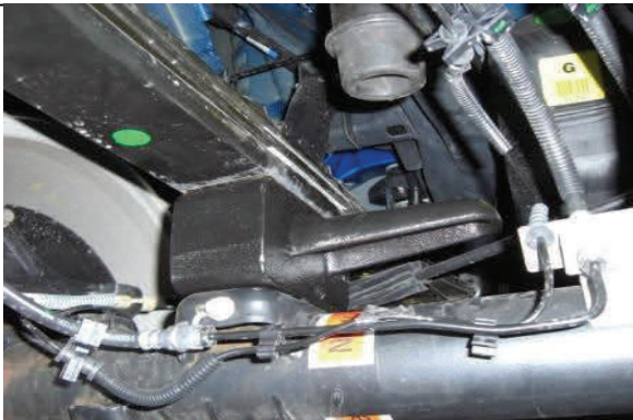
Raise axle and center on locating pins in leaf spring.