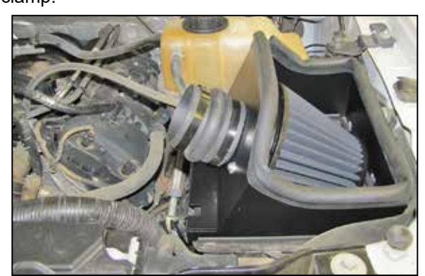
15. Install the provided hump coupling hose (5-580) onto the filter adapter and secure with the provided hose clamp.