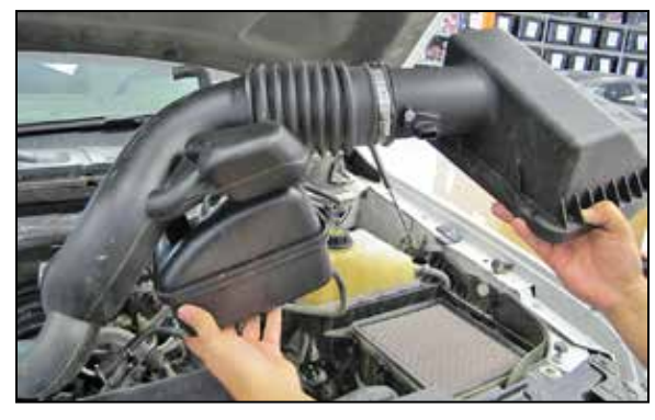
6. Release the three clips securing the upper air box housing to the lower housing and then remove the intake tube/upper air filter housing and air filter from the vehicle.

NOTE: K&N Engineering, Inc., recommends that customers do not discard factory air intake.