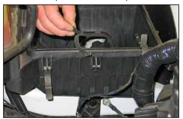
12. Remove the center air box retaining clip.