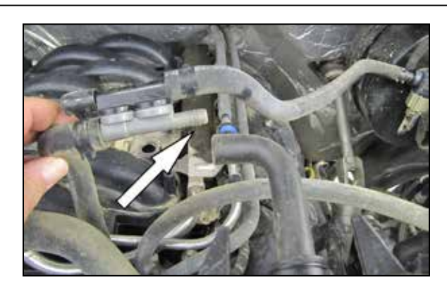
4. Disconnect the EVAP hose from the check valve as shown.