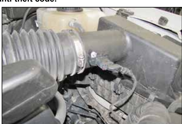
2. Release the red locking tab and then disconnect the mass air sensor electrical connection.

NOTE: Disconnecting the negative battery cable erases pre-programmed electronic memories. Write down all memory settings before disconnecting the negative battery cable. Some radios will require an anti-theft code to be entered after the battery is reconnected. The anti-theft code is typically supplied with your owner's manual. In the event your vehicles anti-theft code cannot be recovered, contact an authorized dealership to obtain your vehicles anti-theft code.