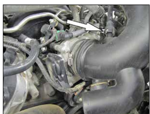
3. Rotate the locking tab and then unhook the crank case vent hose from the factory intake tube.