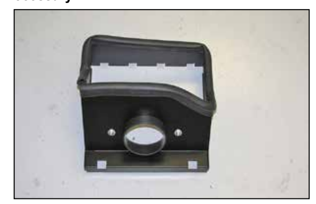
8. Install the filter adapter into the heat shield and secure with the provided hardware.