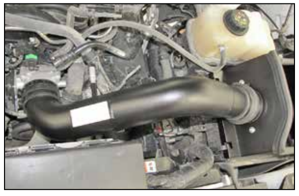
19. Install the intake tube assembly into the silicone hose at the filter adapter and then into the silicone hose on the throttle body and secure with the provided hose clamps.