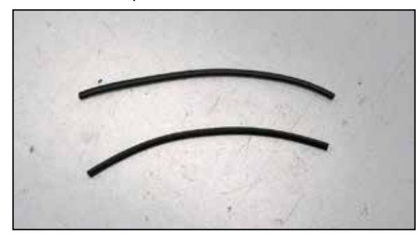
9. Cut the provided edge trim into two 9" sections as shown.