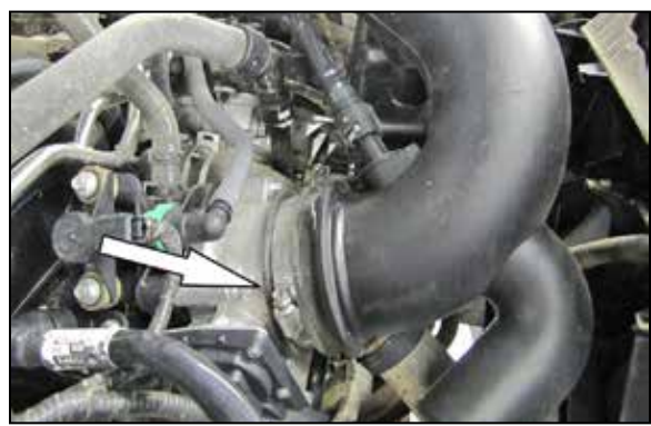
5. Loosen the hose clamp securing the factory intake tube to the throttle body.