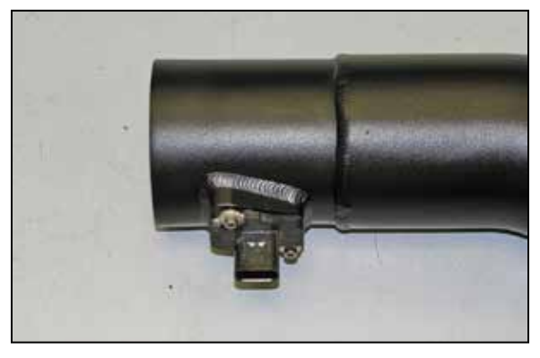
18. Install the mass air sensor into the K&N<sup>®</sup> intake tube and secure with the provided hardware.