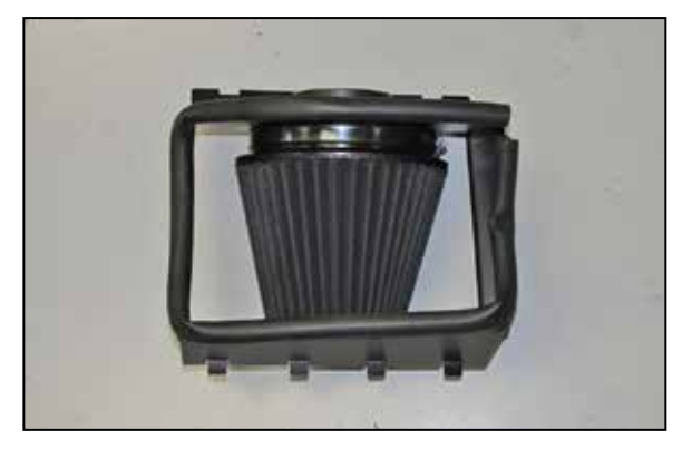
11. Install the air filter onto the filter adapter and secure with the provided hose clamp.