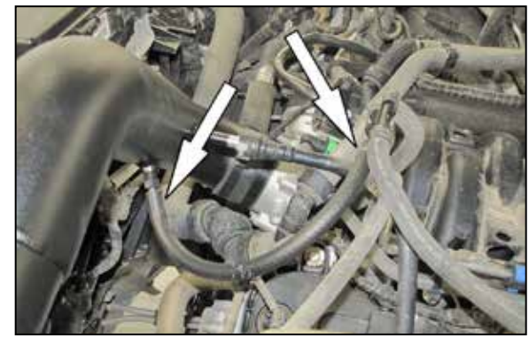
21. Install the provided EVAP vent hose onto the 3/8" fitting installed in the intake tube and then attach the open end to the EVAP check valve.