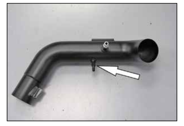
16. Install the provided 3/8" NPT hose fitting into the K&N® intake tube as shown.

NOTE: Plastic NPT fittings are easy to cross thread. Install the vent fitting "hand" tight, then turn it two complete turns with a wrench.