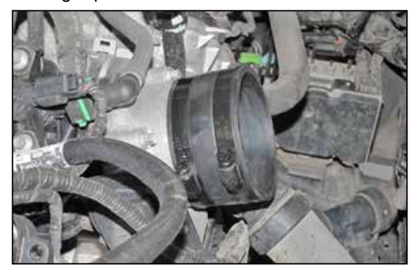
14. Install the provided coupling hose (08630) onto the throttle body and secure with the provided hose clamp.