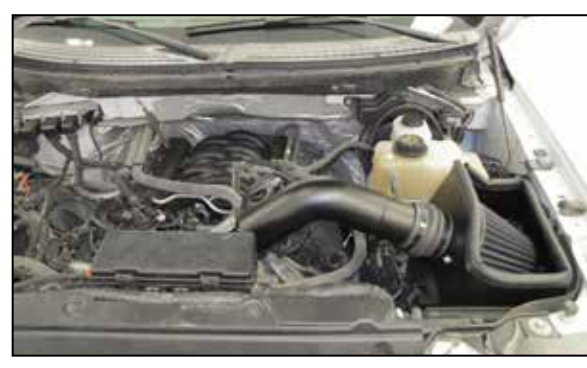
23. Reconnect the vehicle's negative battery cable. Double check to make sure everything is tight and properly positioned before starting the vehicle.