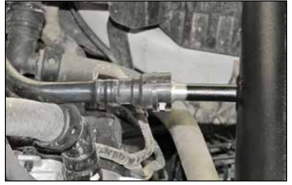
20. Connect the crank case vent hose to the quick disconnect fitting on the K&N® intake tube. NOTE: The factory plastic vent hose will need to be rotated so the connector will align with the fitting on the intake tube.