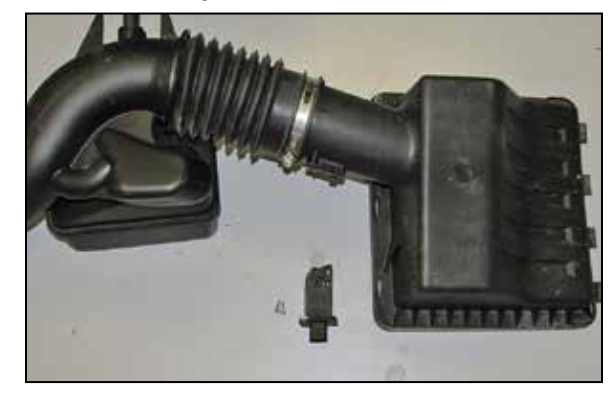
17. Remove the two screws securing the mass air sensor and then remove the mass air sensor from the stock intake tube as shown.

NOTE: Plastic NPT fittings are easy to cross thread. Install the vent fitting "hand" tight, then turn it two complete turns with a wrench.