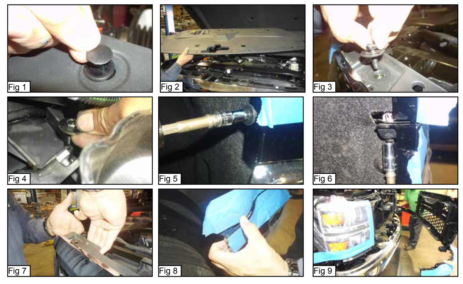
Continued on page 2

Remove 12 plastic pop clips from the top of the plastic radiator cover with a flat screwdriver. Remove the plastic radiator cover (Fig 2). Remove four 10mm bolts from along the top of the factory grille (Fig 3). Remove four 10mm bolts from the bottom of the factory grille, two are on the corners and two are in the center of the bottom of the factory grille (Fig 4). These can be accessed from underneath the vehicle or by reaching down through the top of the engine compartment. Remove two 6mm bolts from the forward section of each front fenderwell where the bumper meets the fender (Fig 5 & 6). Now pull up on each top corner of the factory grille while pulling slightly forward, this will release the top of the factory grille (Fig 7). Now grab the top plastic bumper cover at the fenderwell where it meets the bumper (this is where you removed the bolts from earlier) and pull the bumper cover outward until it un snaps (Fig 8). Now remove the factory grille (the top plastic bumper cover is connected to the factory grille and will be removed with it (Fig 9). Place the grille/top bumper cover on a workbench.