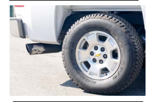
7. Be sure to check all clearance after each section has been tightened to be sure there is proper clearance. It may take 4-500 miles for your vehicle to fully adjust to the changes in exhaust flow.