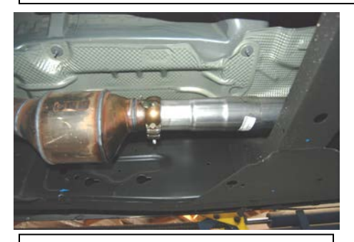
2. Install Head pipe Item # A onto the factory flange. You will re use the factory clamp at this connection. Loosely tighten down the clamp.

1. Disconnect the negative battery cable before removal of the OEM Exhaust. This will allow the computer to reset and recognize the new exhaust. Lay out the exhaust on the floor so it looks like the drawing and compare parts with manual. Remove the factory exhaust by cutting behind the factory muffler. Once the tail pipe has been removed un-bolt the muffler and head pipe at the flange located behind the catalytic converter. Use wd-40 or another type of penetrating oil to remove the rubber grommets. Do not damage these they will be re used.