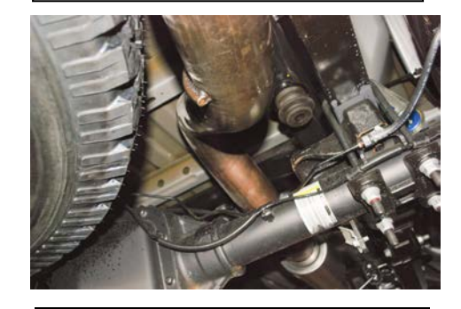
6. With proper clearance from spare tire install the exhaust tip onto the tailpipe. The system was designed to have the tip 1" below the quarter panel of the vehicle. With the tip in your desired position begin to tighten down all clamp connections from the front head pipe back.