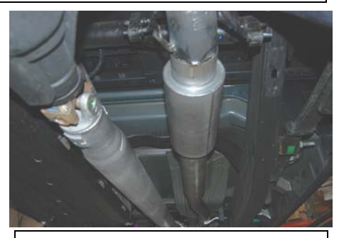
4. Install over axle pipe Item # C into the muffler outlet. Slip the hangers into the rubber grommets and keep tailpipe loose.