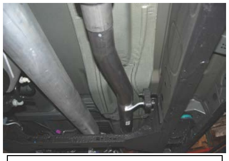
3. Install muffler assembly Item # B onto the head pipe. You may need to use a jack stand to support the muffler while installing the tailpipe. Use Item# E to clamp the muffler assembly to the head pipe. Loosely tighten down.