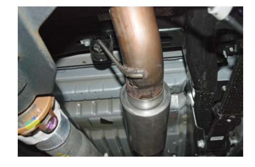
5. With everything loose you may need to adjust the system for proper clearance of shocks, brake lines, ect.