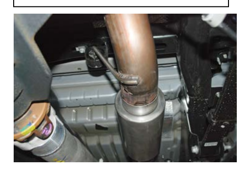
5. With everything loose you may need to adjust the system for proper clearance of shocks, brake lines, ect.

2. Install Head pipe Item # A onto the factory flange. You will re use the factory clamp at this connection. Loosely tighten down the clamp.