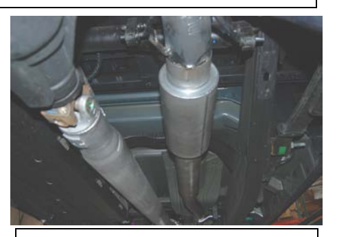
4. Install over axle pipe Item # C into the muffler outlet. Slip the hangers into the rubber grommets and keep tailpipe loose.

6. With proper clearance from spare tire install the exhaust tip onto the tailpipe. The system was designed to have the tip 1" below the quarter panel of the vehicle. With the tip in your desired position begin to tighten down all clamp connections from the front head pipe back.